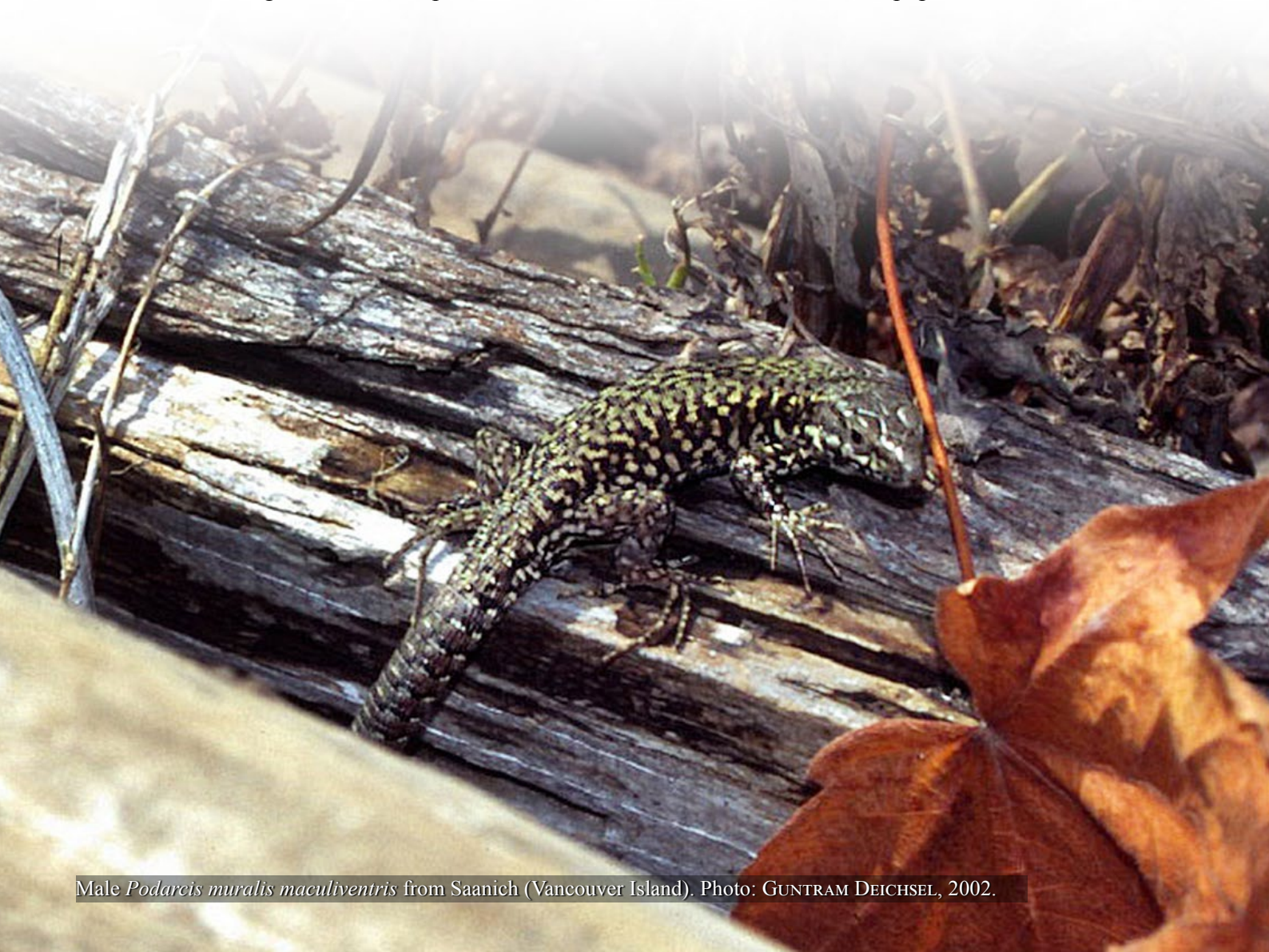
Male Podarcis muralis maculiventris from Saanich (Vancouver Island).