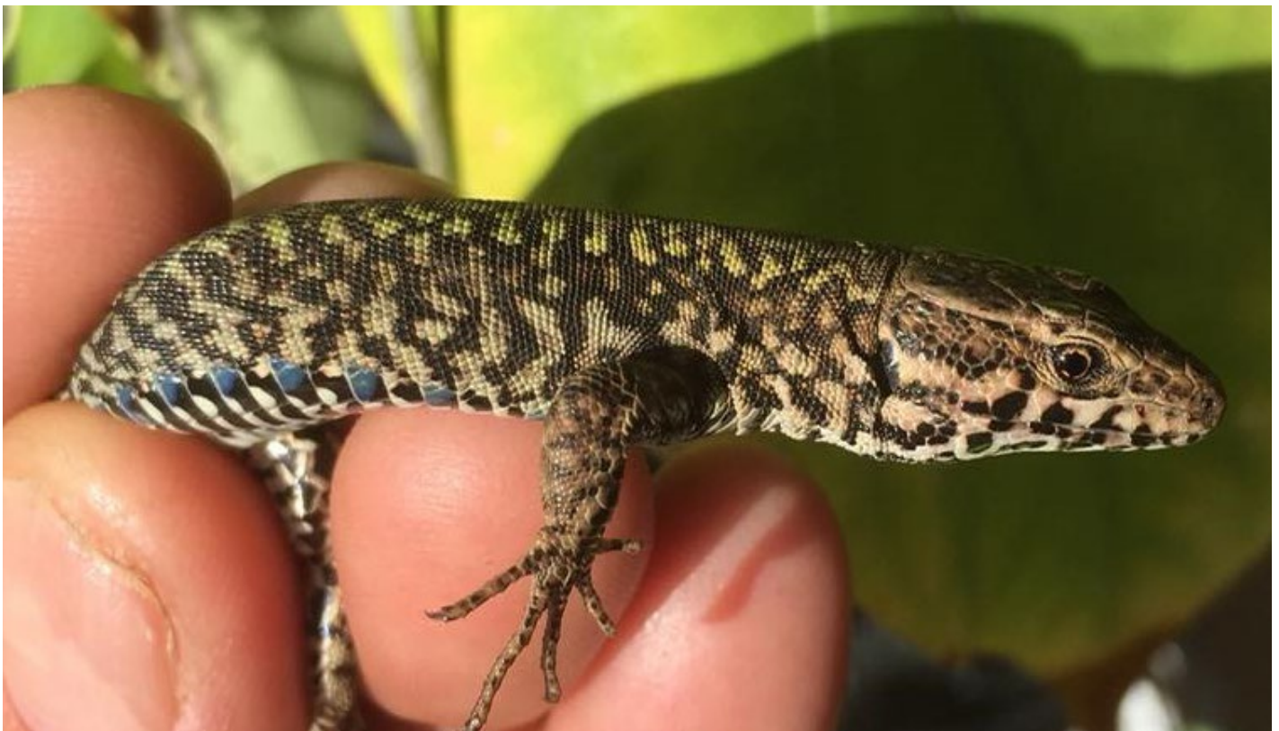
An adult common wall lizard captured in Victoria in 2018.

The wall lizard population is now far denser than that of the northern alligator lizard, which is native to Vancouver Island. HANKE indicates that where the two species live together, there is "one alligator lizard for every 30 or 40 wall lizards." When HANKE estimated 500,000 wall lizards in the region, he assumed 20 lizards, on the low end, in every garden