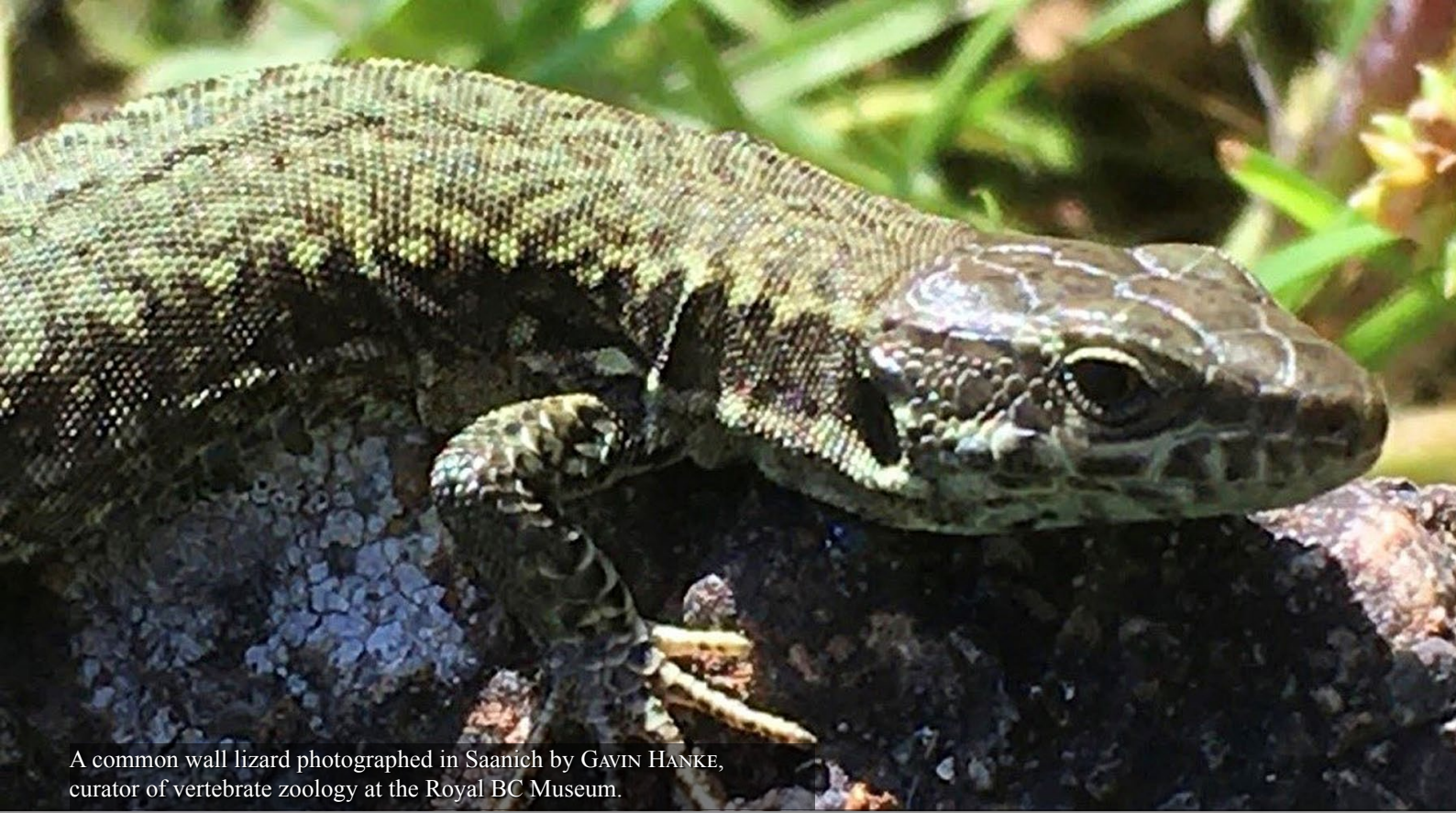
A common wall lizard photographed in Saanich by GAVIN HANKE, curator of vertebrate zoology at the Royal BC Museum.