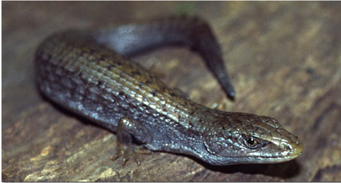
Northern alligator lizard Elgaria coerulea principis recorded at the Department of Biology / University of Victoria.

in Saanich and Victoria. As some citizen reports in central Saanich indicate thousands of lizards in their backyards, the actual number could be much higher.