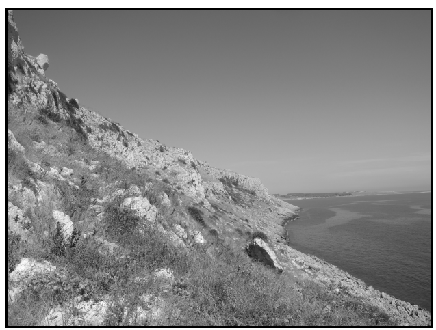
Figure 3 . Biotope of Algyroides nigropunctatus nigropunctatus in "Costa Otranto—Santa Maria di Leuca e Bosco di Tricase" Natural Regional Park, Lecce Province, southeastern Italy.

The combined presence of a blue throat in adult males, of two postnasals, of small granular scales on lower flanks and the absence of a dark lateral band on flanks and of a dark vertebral line readily distinguishes the Apulian Algyroides from A. fitzingeri (Wiegmann, 1834), A. marchi Valverde, 1958 and A. moreoticus Bibron and Bory, 1833 (Arnold et al., 2007). The fourth species in the genus, Algyroides nigropunctatus, is found along the eastern Adriatic coast from northeastern Italy to western Greece and the Ionian islands. Only two subspecies are currently recognized. The possession of an orange belly and a blue throat is typical of the nominal subspecies and absent in Algyroides nigropunctatus kephallithacius Keymar, 1986. Males of the latter subspecies, endemic to the Greek islands of Kefallonia and Ithaca, show a yellow belly and a greenish throat (Peek, 2007). All the meristic, morphometric and chromatical