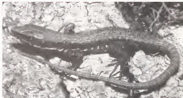
Fig. 16. Adolfus africanus from Kakamega Forest.

Remarks: T. striata is one of the species with the highest density in Kakamega area and was found everywhere outside the forest or wooded areas. But meanwhile the species has reached the BIOTA Camp, located on a small clearing of Udo's Campside inside the forest. Here and on the houses of the near villages it is sympatric with Adolfus jacksoni (Lacertidae) and only on the houses also with Acanthocercus atricollis (Agamidae). In contrast to the data given by RAZZETTI & MSUYA (2002) and SPAWLS et al. (2002), T. striata was never found on trees or in plantations. The diet analysed by FINK (2003) is dominated by Coleoptera and also consists of other winged insects, collembolans, spiders, nematodes and molluscs.