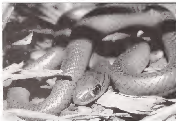
Fig. 21. Psammophis phillipsi from Kakamega Forest.

Remarks: These vouchers represent the first record of the species for Kenya. For the taxonomic assignment see P. mossambicus . SPAWLS et al. (2002) placed the eastern populations of P. phillipsi and P. sibilans in the synonymy of