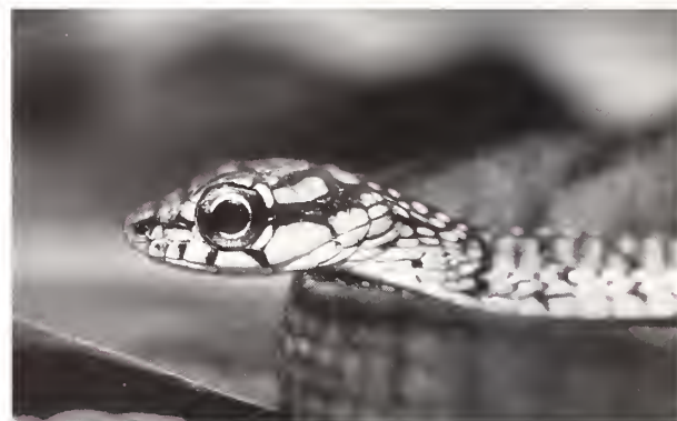
Fig. 22. Thrasops aethiopissa from Kakamega Forest.

Remarks: This taxon is only known from literature (SPAWLS et al. 2002). Further data are not available.