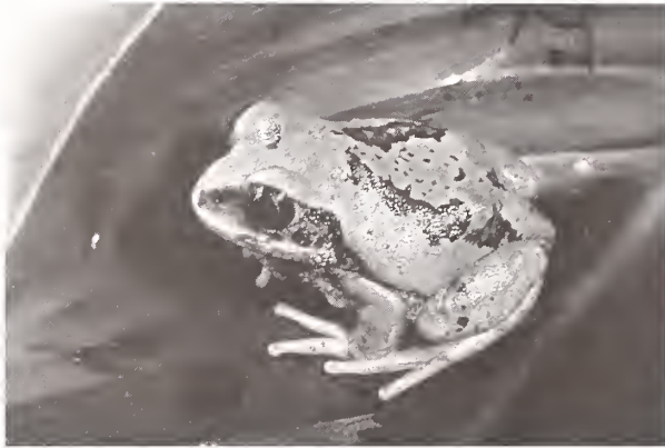
Fig. 8. Leptopelis aff. bocagii undescribed form from Kakamega Forest.