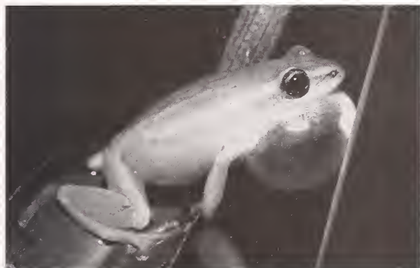
Fig. 5. Hyperolius cinnamomeoventris from Kakamega Forest.

Remarks: Details on the vouchers are unknown, but most are from the Buyangu area. H. viridiflavus is the most common frog inside the forest. Specimens were observed at different ponds and also clearings for example, the BIOTA field camp, where several specimens were sitting inside the lavatory. NMK A/1193/1-2 were from Malava forest.