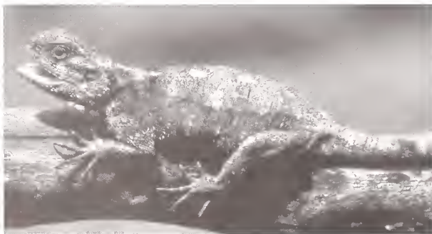
Fig. 9. Acanthocercus atricollis from Kakamega Forest.

Remarks: The debate of the taxonomic status of this species is still ongoing. Many authors (e. g. BOULENGER 1896, KLAUSEWITZ 1957, LOVERIDGE 1957) have discussed differences or similarities between this taxon and Acanthocercus cyanogaster RÜPPELL 1835. SPAWLS et al. (2002), LARGEN & SPAWLS (2006) and our own morphology studies of the two species support KLAUSEWITZ (1957) who regarded them as two distinct species. The reported distribution of both taxa is unclear because of the mentioned taxonomic problems.