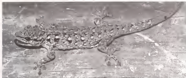
Fig. 14. Lygodactylus gutturalis from Kakamega Forest.