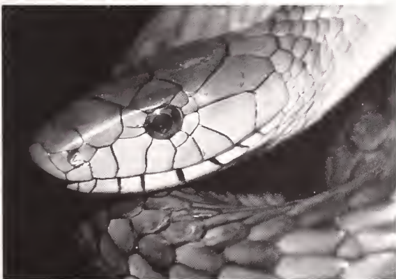
Fig. 23. Dendroaspis jamesoni kamosae from Kakamega Forest.