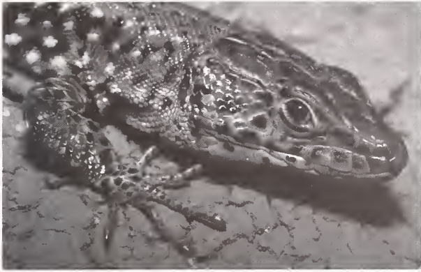
Fig. 17. Adolfus jacksoni from Kakamega Forest.