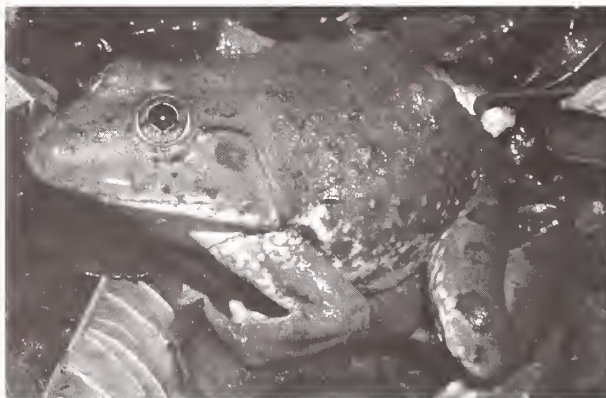
Fig. 2. Hoplobatrachus occipitalis from Kakamega town.

Remarks: The voucher was collected in a swamp in the Buyangu area. Specimens, both adults and tadpoles, were found in an old swimming pool of the Serena Island Lodge in Kakamega town and were documented by a voucher specimen (NMK uncatalogued) and photographs.