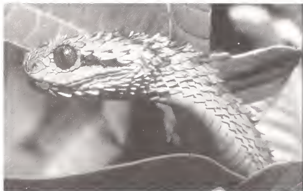
Fig. 24. Atheris hispida from Kakamega Forest.