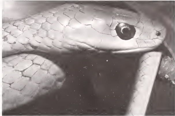
Fig. 20. Philothamnus battersbyi from Kakamega Forest.

Remarks: Philothamnus is probably one of the most difficult for the taxonomists, reptile genera in Africa. But P. battersbyi is relatively easy to identify by the uniform green colouration, two supralabials entering the eye, a divided anal scale, 15 midbody scale rows and no keels on the subcaudal scales. It can only be confused with the likewise uniform green P. angolensis . Most vouchers collected within the study were found in Buyangu Village basking on small bushes. One was found killed on the road.