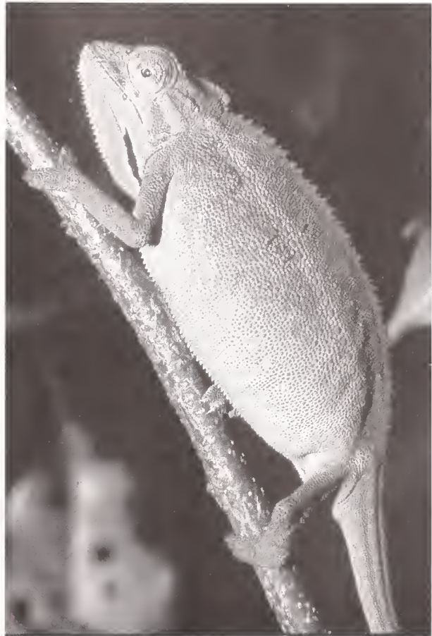
Fig. 11. Chamaeleo elliotti from Kakamega Forest.

Remarks: This voucher was collected in Kakamega town, so it is possible that the species also occurs in the surrounding area of Kakamega Forest.