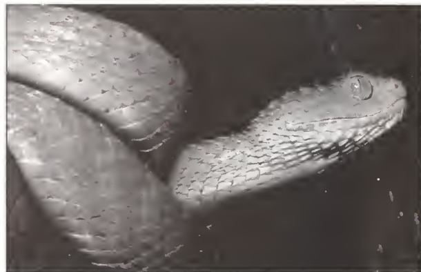
Fig. 25. Atheris squamigera from Kakamega Forest.

(HUGHES & BARRY 1969) in the west to Kenya in the east, southwards to Angola and Tanzania. Additionally studies may demonstrate differences between the populations. In Kenya A. squamigera is, with two exceptions, only known from Kakamega Forest. Two records are from outside the forest: one specimen from Chemilil and one sighting from the Soit Ololol Escarpment (SPAWLS et al. 2002). Specimens collected in this study were exclusively found near water bodies in the Buyangu area. They were found by hunting by torchlight and basking on small bushes or in leaf litter at daytime.