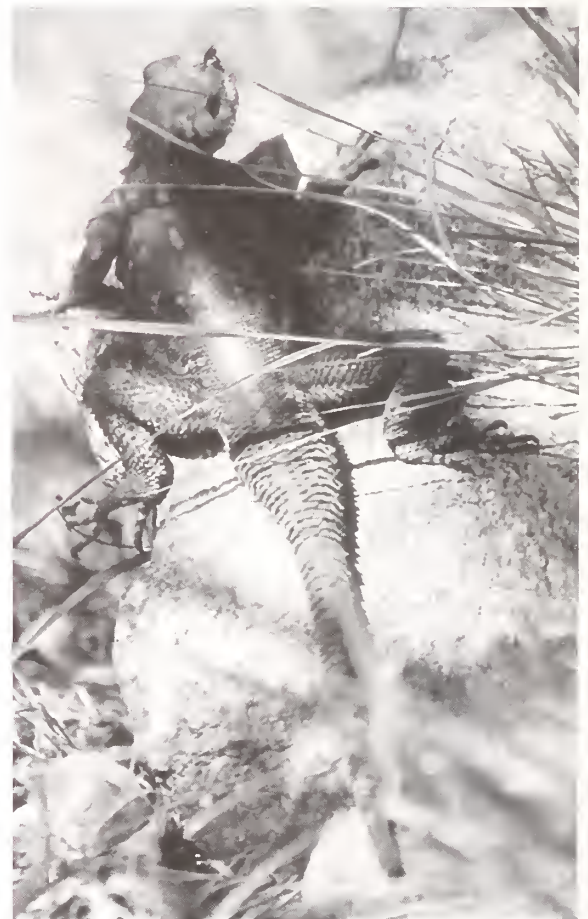
Fig. 10. Agama kaimosae from Ngoromosi/ Nandi escarpment.

The diagnoses of the subspecies of A. atricollis by KLAUSEWITZ (1957) are not adequate. Therefore, the material is only preliminarily assigned to the subspecies ugandaensis because Kakamega Forest is geographically closer to the area of this subspecies than to minuta , according to KLAUSEWITZ's (1957) map: A. a. minuta inhabits Ethiopia and eastern Kenya, while A. atricollis ugandaensis occurs within Uganda and western Kenya.