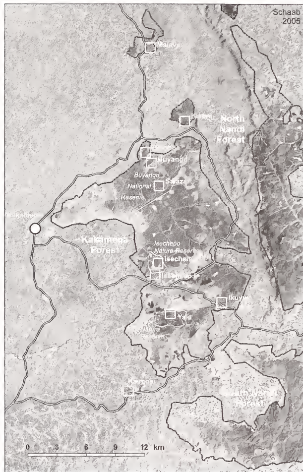
Fig. 1. The main areas of investigation of BIOTA East Africa in the Kakamega Forest in the background a subset of a Landsat 7 (ETM+) scene from 5 Feb 2001, contrast-enhanced band combination 5/4/3 for within-forest differentiation but printed in black and white.

seale, Kakamega forest is not considered as a hot-spot because in comparison with e. g. the Mt. Nlonako in Cameroon (99 amphibian [HERRMANN et al. 2005a] and 89 reptile species, [HERRMANN et al. 2005b]) the diversity is comparatively low.