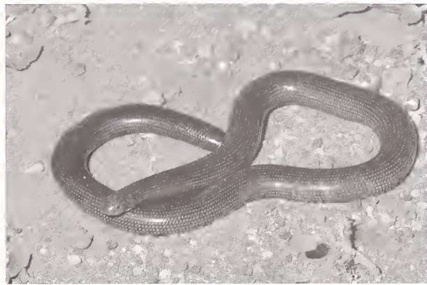
Fig. 18. Typhlops lineolatus from Kakamega Forest.

Remarks: This taxon is known only from literature (LOVERIDGE 1935) and further data were not available.