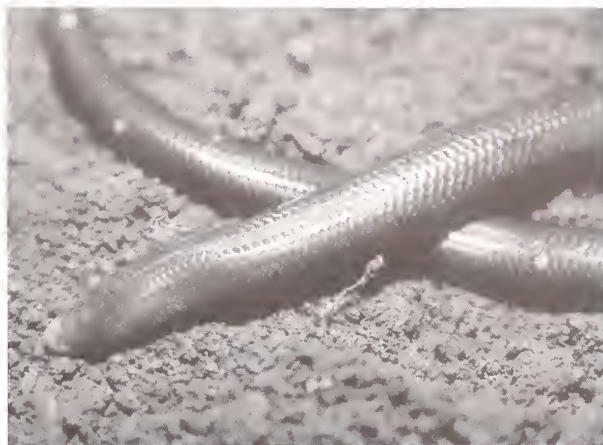
Fig. 15. Feylinia currori from Kakamega Forest.

leaf litter (NMK L/2662). A morphological comparison between east and west African populations results in no geographic directed differences (WAGNER & SCHMITZ 2006).