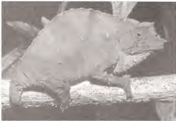
Fig. 12. Rhampholeon boulengeri from Kakamega Forest.