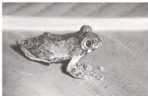
Fig. 7. Leptopelis mackayi from Kakamega Forest.

Remarks: All vouchers were from the Buyangu area and some were collected with a drift fence next to a pond. One specimen was collected on the Buyangu Hill outside the forest under stones.