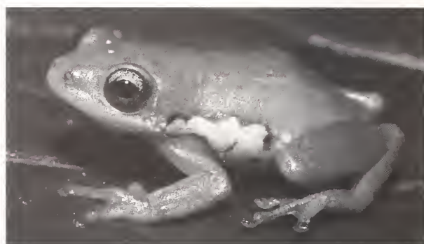
Fig. 4. Hyperolius lateralis from Kakamega Forest.

Remarks: NMK A/3103, A/3867, A/4011, A/4026 and ZFMK 81745-746 were from the Buyangu area. NMK A/4065 was collected at the BIOTA Campsite. Details on the other vouchers are unknown.