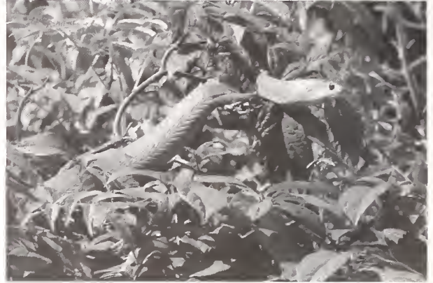
Fig. 19. Dispholidus typus from Kakamega Forest.

Specimens examined. NMK O/2715; ZFMK 82053.