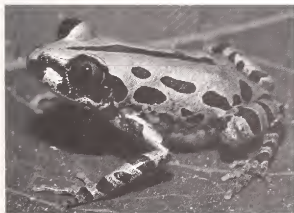
Fig. 6. Kassina senegalensis from Kakamega Forest.

Remarks: NMK A/3858, A/4012 and ZFMK 81744 are from the Buyangu area. This taxon was reported by LÖTTERS et al. (2006) as Hyperolius aff. cinnamomeoventris .