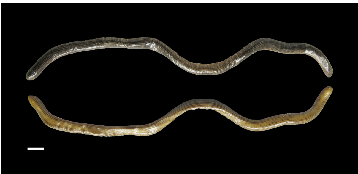
Figure 11. Dorsal and ventral views of the paratype of Typhlops boulengeri Bocage, 1893 (MHNFCP 017434). Scale bar = 10 mm.

Type specimen. A syntype (MHNFCP 017434) from Angola (fig. 11) was donated to the Porto museum from Lisbon. This is supported by the original label on the jar (“ Typhlops boulengeri Boc. / Angola off. Mus. Boc.”) and the fact that the catalog notes that the specimen MHNFCP 017434 was offered by Museu Bocage (L. Sousa, pers. comm.). In his description of this species, Bocage (1893) noted that he received several specimens of this species from Quindumbo, “dans l’intérieur de Benguella” that were collected by the explorer José de Anchieta.