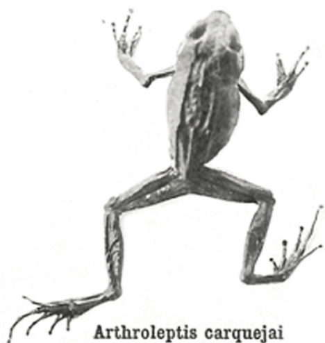
Arthroleptis carquejai n. sp.