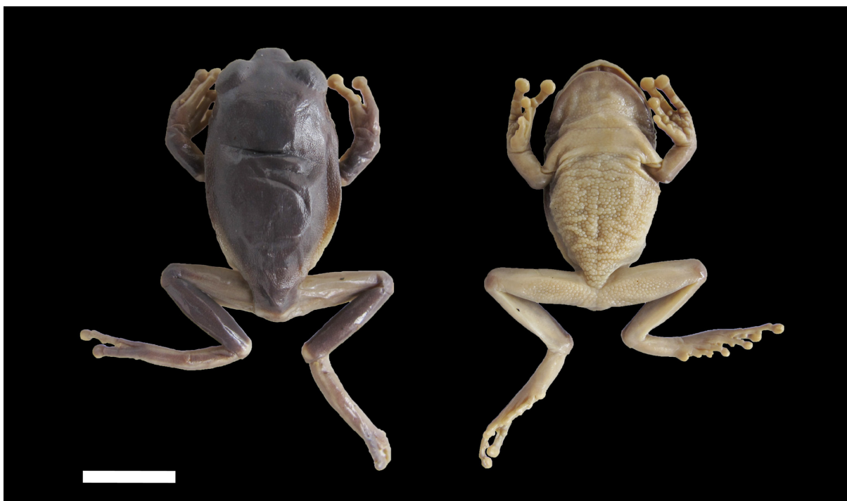
Figure 9. Dorsal and ventral views of the holotype of Hylambates bocagei var. leucopunctata Ferreira, 1906 (MHNFCP 017324). Scale bar = 10 mm.

on our examination, the principal morphological feature suggesting that “var. leucopunctata ” is distinctive is the expansion of the terminal disks of the fingers, as noted by Ferreira (1904). While suggestive given the typically non-expanded digits of Leptopelis bocagii , the absence of interdigital webbing clearly places the remaining syntype with this species. In addition, the geographic distribution of Ferreira’s taxon occurs on the northwestern margin of the wide geographic range of L. bocagii . Based on available evidence, we follow Amiet (2012) and Frétey et al. (2011) by suggesting that Hylambates bocagei var. leucopunctata should remain a synonym of L. bocagii .