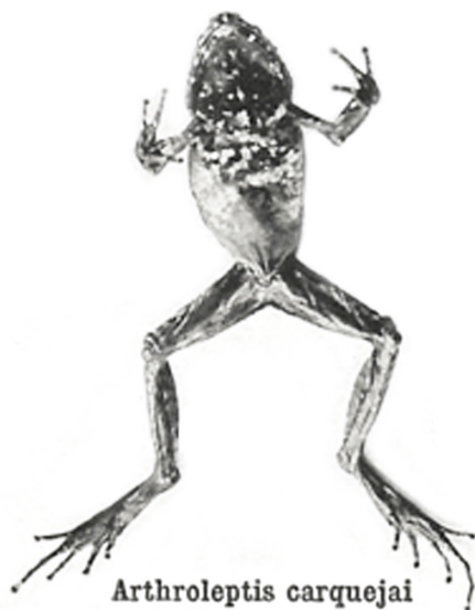
Arthroleptis carquejai n. sp.