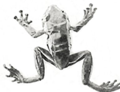
Rappia fasciata n. sp.