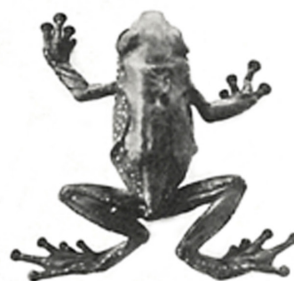
Rappia osorioi n. sp.