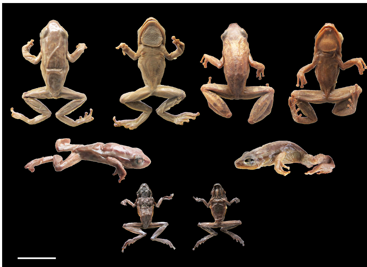
Figure 3. Dorsal and ventral views of the three syntypes of Rappia bivittata Ferreira, 1906. Top left: MHNFCP 017302 from Rio Luinha, Angola. Top right: dorsal and ventral views of MHNFCP 017291 from N’golla Bumba, Angola. Below: Dorsal and ventral views of MHNFCP 017296, which is in poor condition because of past dehydration, from, Quilombo, Angola. Scale bar = 10 mm.

Present name. Hyperolius platyceps (Boulenger, 1900).