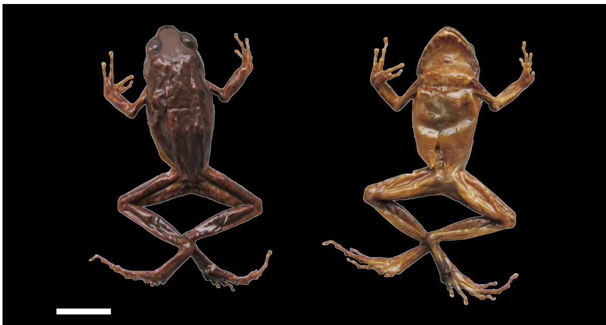
Figure 10. Dorsal and ventral views of the holotype of Arthroleptis carquejai Ferreira, 1906 (MHNFCP 018586). Scale bar = 10 mm.