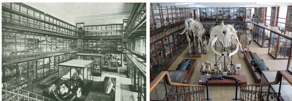
Figure 2. Picture of the General room of the Museu de História Natural da Universidade do Porto at the beginning of the twentieth century (left) and actual picture of the same room (right).