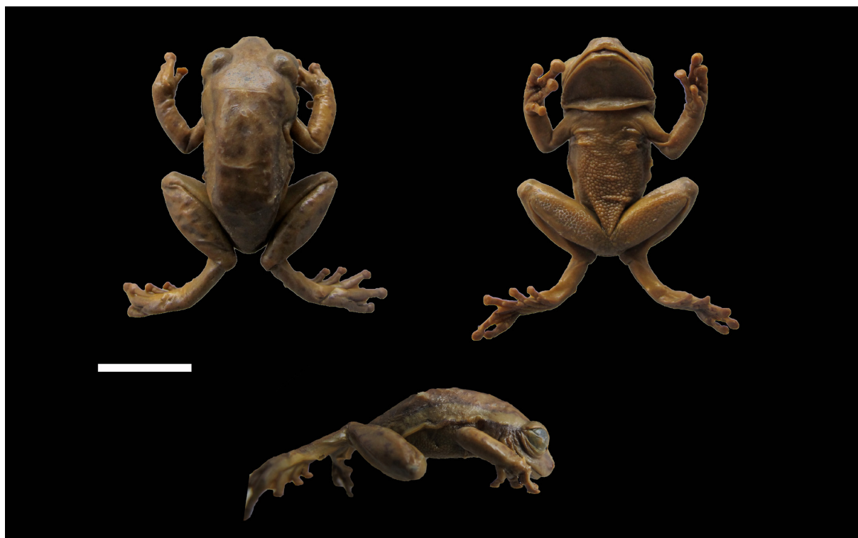
Figure 4. Dorsal and ventral view of the holotype Rappia fasciata Ferreira, 1906 (MHNFCP 017294). Scale bar = 10 mm.

The holotype of Rappia fasciata presents characters that allow it to be identified specifically as the pleurotaenia morph of H. platyceps (Frétey et al. , 2011; Amiet 2012). These characters include its stout body, large head with a rounded snout, and prominent dorsolateral stripes. Amiet (2012) used both the wider head and shorter snout of H. platyceps as diagnostic features relative to H. cinnamomeoventris , and both characteristics are present in the holotype of Rappia fasciata . As also indicated by Amiet (2012), the flattened granulations on the palmar and plantar surfaces also indicate that the holotype is more similar to H. platyceps than H. cinnamomeoventris .