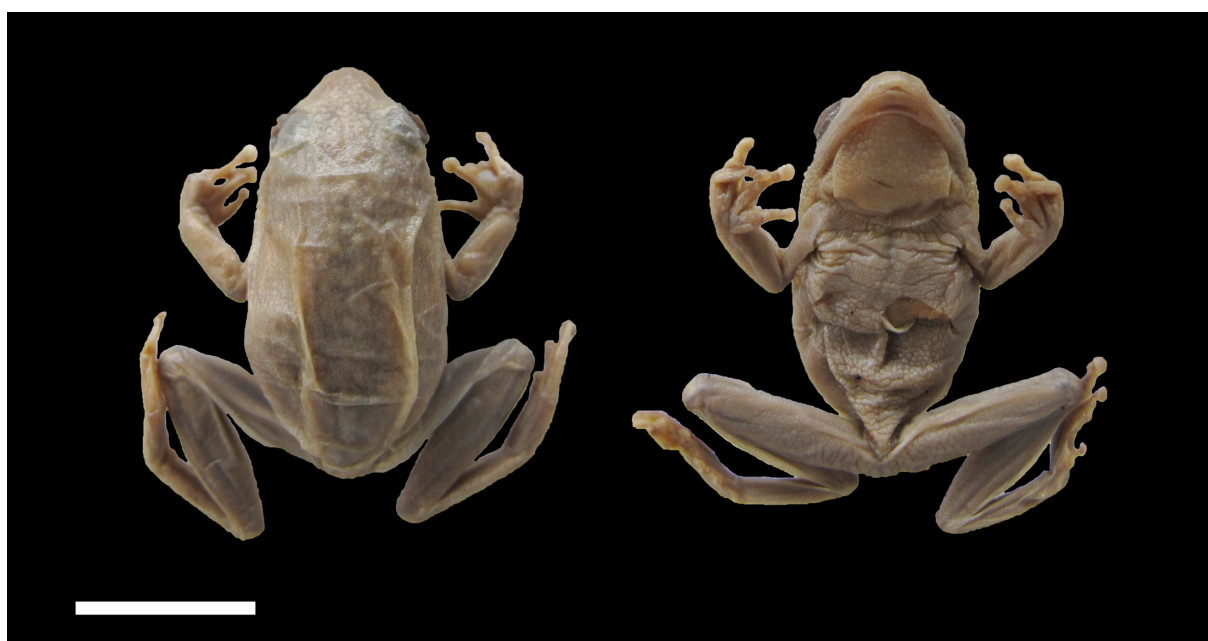
Figure 8. Dorsal and ventral views of the syntype of Rappia seabrai Ferreira, 1906 (MHNFCP 018587). Scale bar = 10 mm.

Present name. Hyperolius bocagei (Steindachner, 1867).