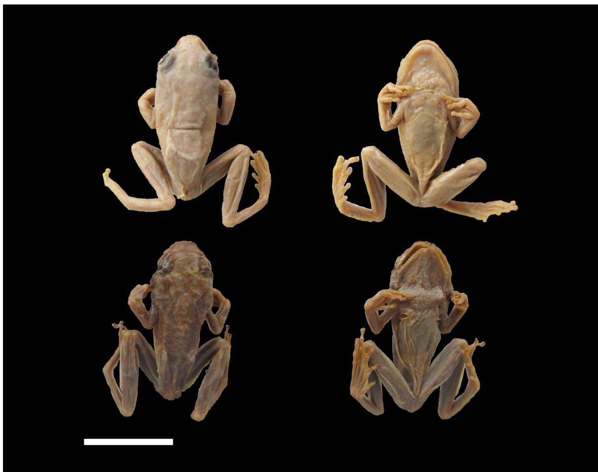
Figure 5. Dorsal and ventral view of the two syntypes of Rappia nobrei Ferreira, 1904 (Top specimen: MHNFCP 017292; lower specimen: MHNFCP 017298). Scale bar = 10 mm.

Present name. Hyperolius cf. adspersus Peters, 1877.