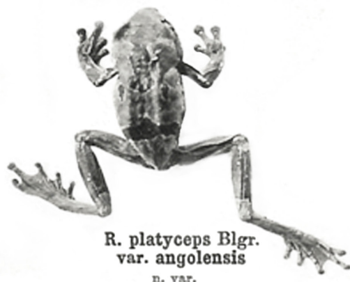
R. platyceps Blgr. var. angolensis n. var.