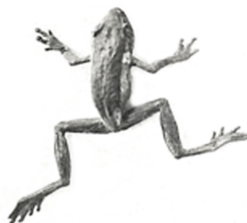
Rappia bivittata n. sp.