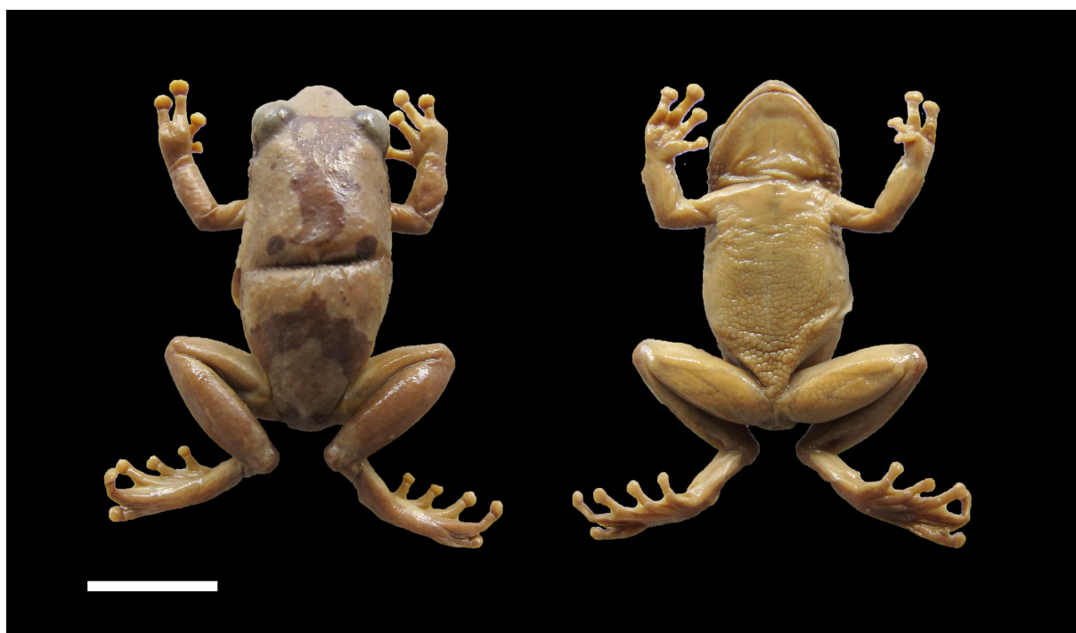
Figure 7. Dorsal and ventral views of the syntype of Rappia platyceps var. angolensis Ferreira, 1906 (MHNFCP 017303). Scale bar = 10 mm.