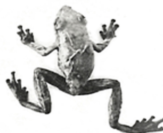
Rappia seabrai n. sp.