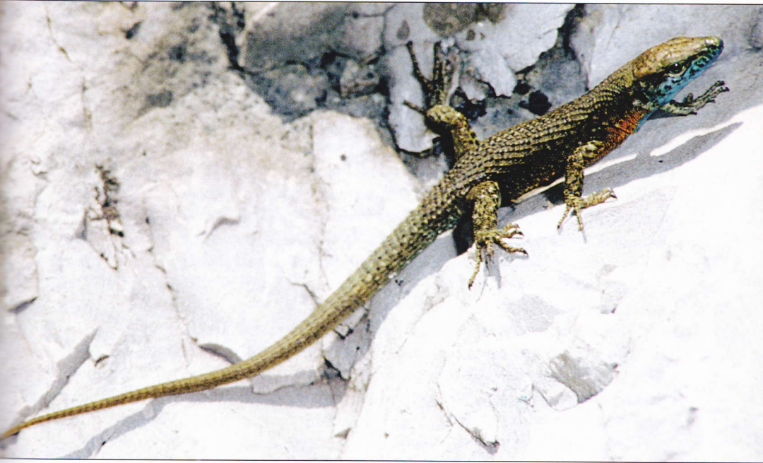
Fig. 35: Algyroides nigropunctatus , Val Rosandra, Trieste.