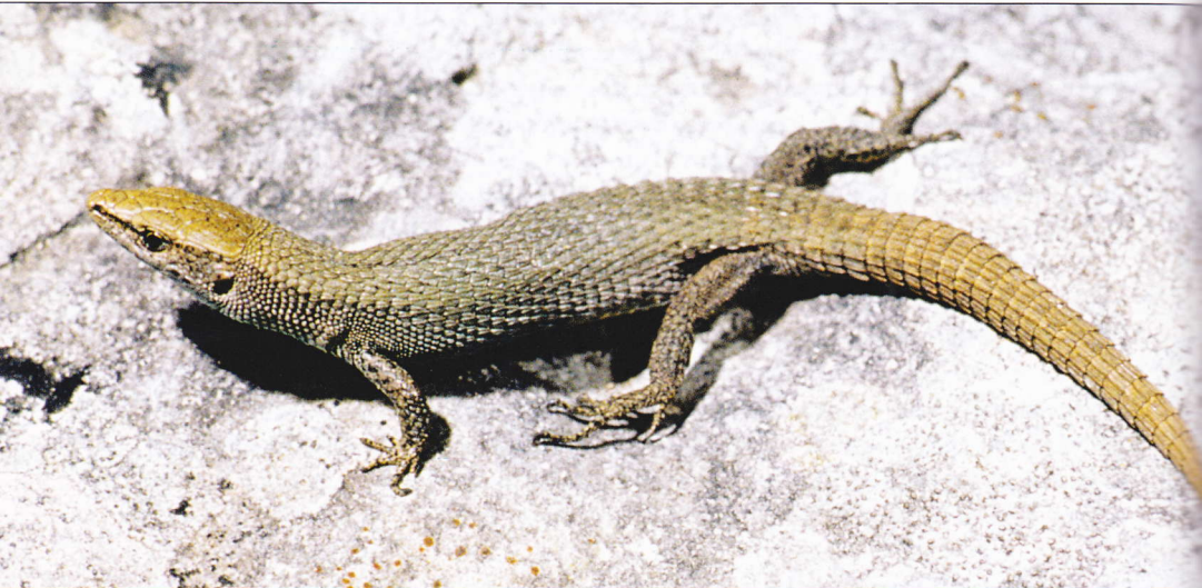
Fig. 30: Algyroides fitzingeri , surroundings of Bonifacio, Corsica, France.