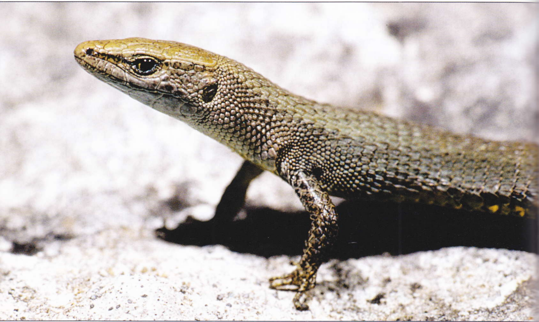
Fig. 29: Algyroides fitzingeri , surroundings of Bonifacio, Corsica, France.