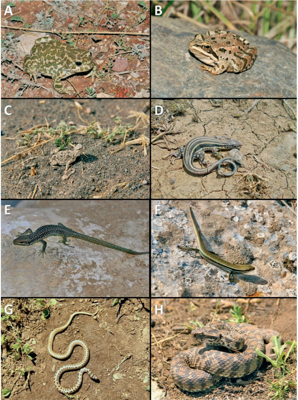
Fig. 2: Some amphibians and reptiles occurring in Ağrı. / Abb. 2: Einige Amphibien und Reptilien der Provinz Ağrı.

A – Bufo variabilis , B – Rana macrocnemis , C – Phrynocephalus horvathi , D – Eremias pleskei , E – Darevskia sapphirina , F – Ablepharus bivittatus , G – Eirenis eiselti , H – Montivipera wagneri (Photos: M. Z. Yıldız & N. İğci).