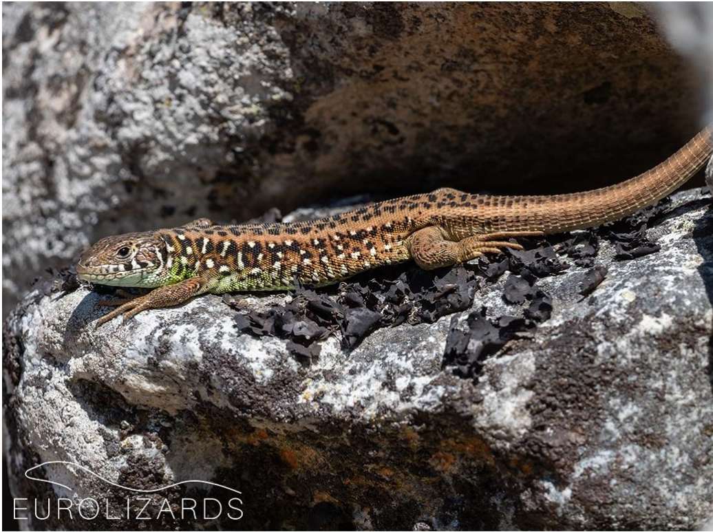
Subadult: E / Montes de León, 05.09.2019 - subadult specimen frequently show brownish colours.