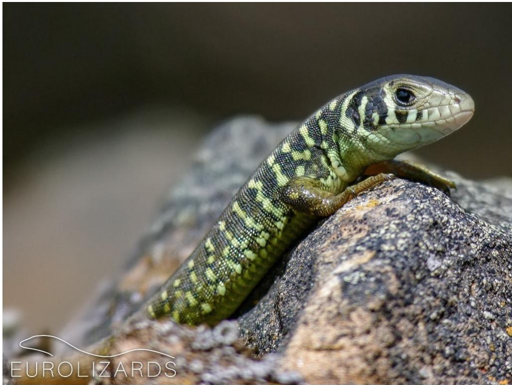
Juvenile: E / Truchas (León), 04.09.2011 - Juveniles can be identified by the light stripes crossing the flanks.