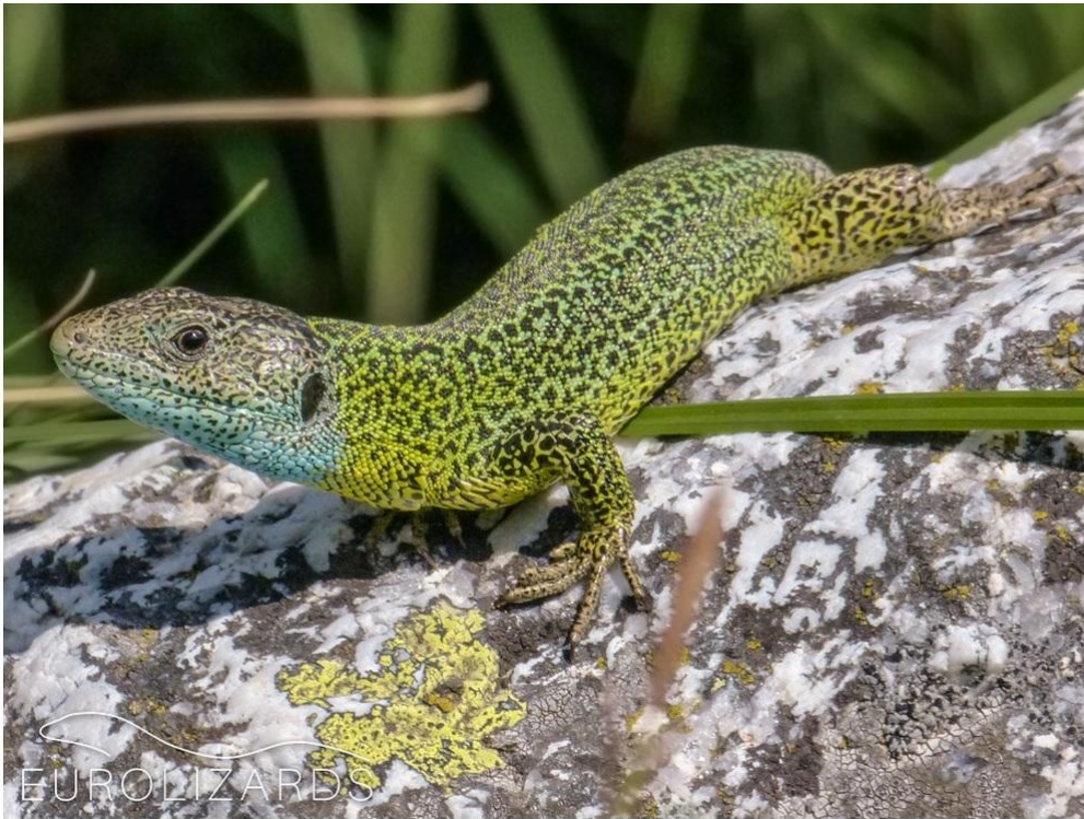
Male: P / Serra da Estrela, 17.07.2013 - In summer, the blue head colouration gets pale.