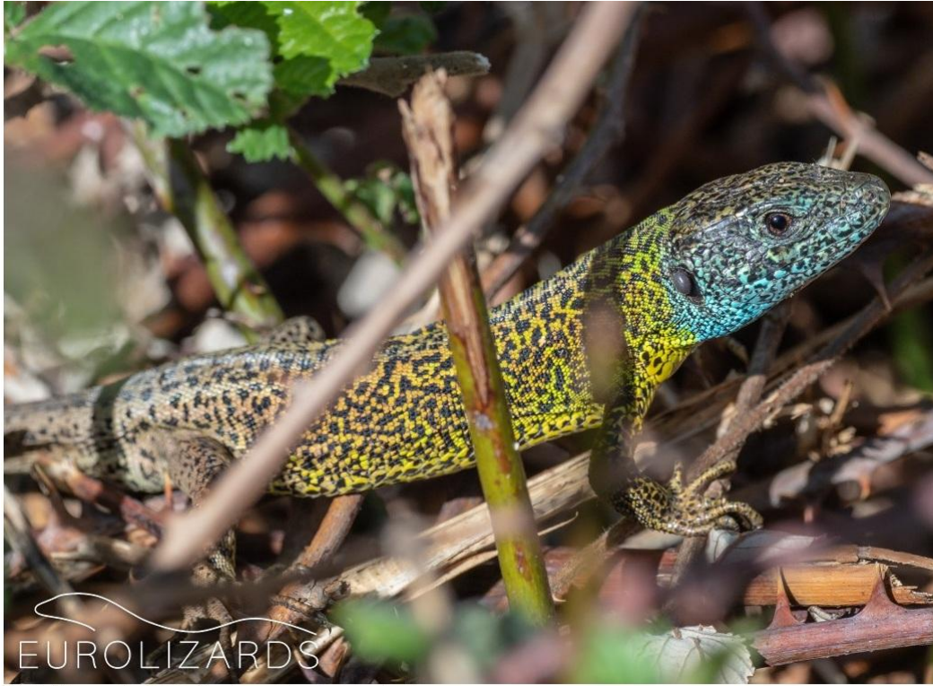
Pair: P / Algarve, 16.04.2017 - Specimen with yellowish coloration.