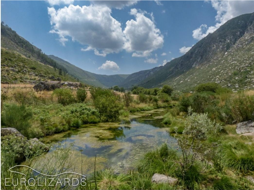
Glacial trough valley in the Serra da Estrela (Portugal): Habitat of Lacerta schreiberi and Podarcis carbonelli .