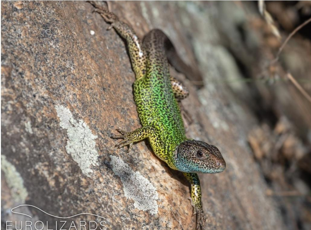
Male; E / Lago de Sanabria (Zamora), 19.09.2017 - Note the green back and the brownish tail.

Compared to the other European members of the genus Lacerta , which inhabit a wide distribution range, Schreiber's Green Lizard is limited to Western Spain and Portugal. Once again, the Iberian Peninsula proves as a rich source of endemism.