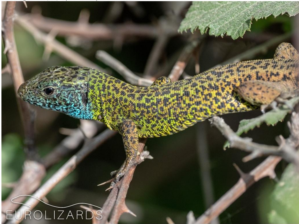
Male: P / Algarve, 16.04.2017 - These lizards can be frequently encountered basking in spiny blackberry scrubs.