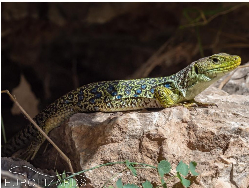
Subsp. lepidus, young male: E / La Toba (Jaen), 20.09.2018 - Note the blue ocelli on the flanks.

Being the biggest European Lacertid, the Ocellated Lizard is a highlight of the European fauna. These bold reptiles with conspicuous ocelli pattern are real eye-catchers. However, these shy lizards can be a challenge for photographers, sometimes: so, patience is the key.