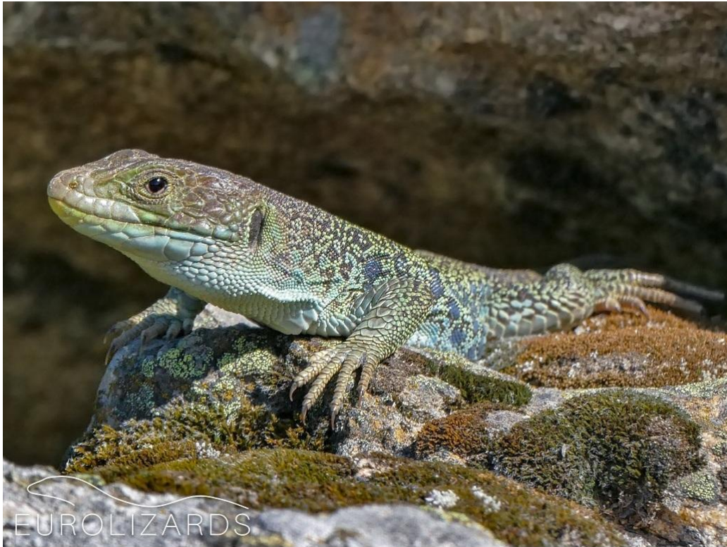
Subsp. lepidus, male: E / Lago de Sanabria (Zamora), 01.09.2014 - Possibly, this population refers to subspecies ibericus.