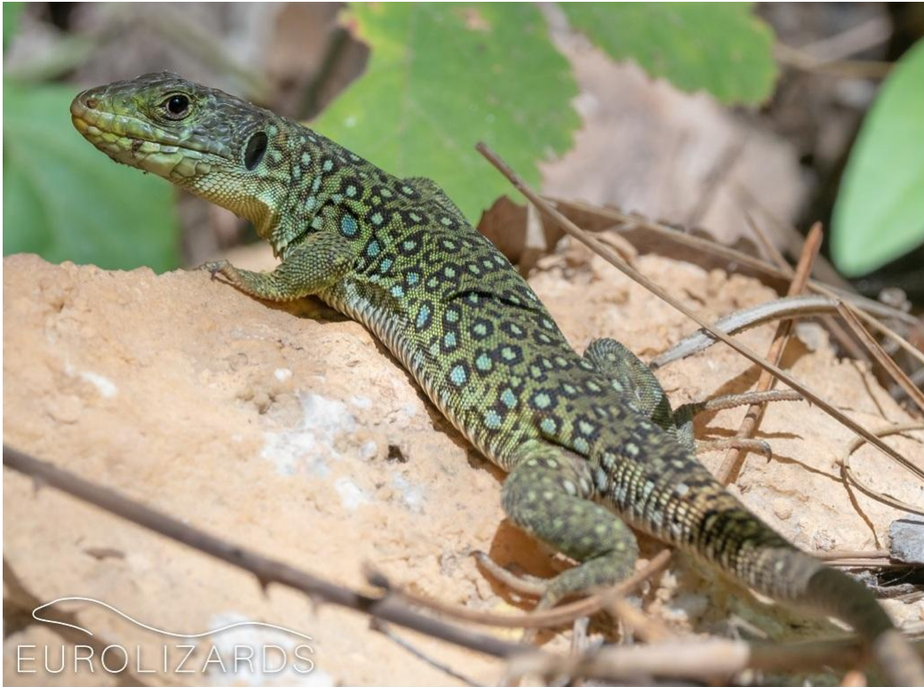
Subsp. lepidus, subadult: E / La Toba (Jaén), 20.09.2018 - Subadult specimens show ocelli on the back which are dispersed in adults.