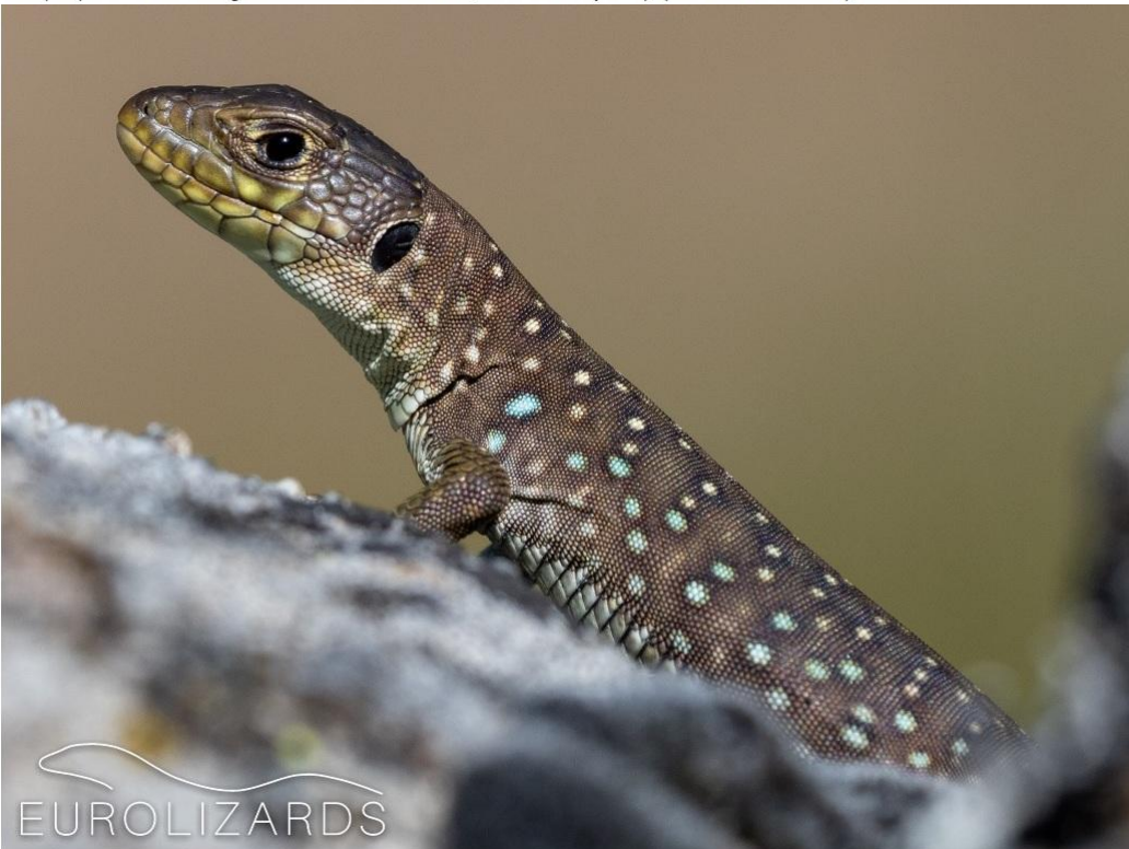
Subsp. lepidus, juvenile: E / Lago de Sanabria (Zamora), 19.09.2017