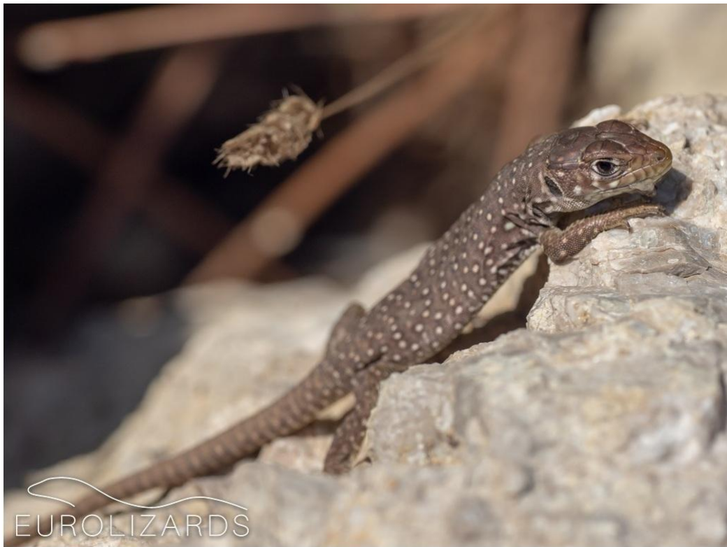
Subsp. lepidus, juvenile: E / Riöpar (Albacete), 21.09.2018 - Note the brownish colouration with light dots.