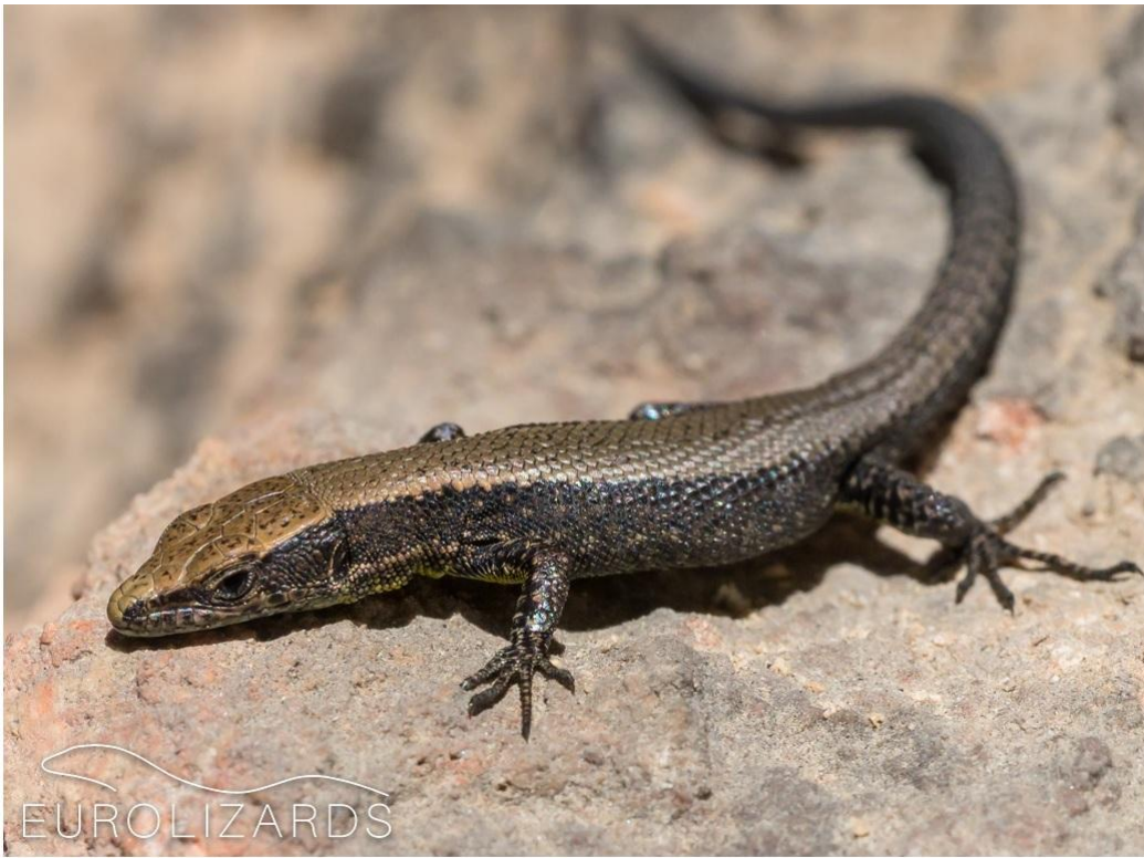
Juvenile: E / Cazorra (Jaén), 30.10.2017