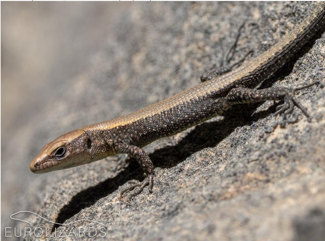
Adult: E / Riópar (Albacete). 02.10.2016 - Adults frequently show yellow throats and undersides.