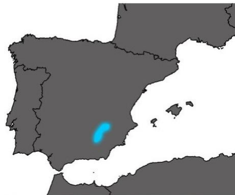
The distribution range of Algyroides marchi is limited to the pre-Baetic mountain range in southeastern Spain.

Psammotromus algirus also has keeled scales but shows distinct light dorsolateral lines which lack at Algyroides marchi.