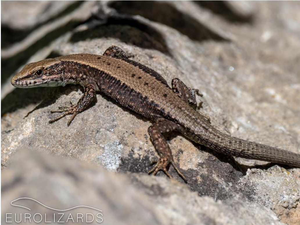
Adult: E / Huelga Utrera (Jaén), 20.09.2018 - Note the keeled scales which are characteristic for the genus Algyroides.

The genus of Algyroides comprises a group of possibly ancient species, which formerly may have been widely distributed within Europe. However, the currently four species of this genus inhabit a disjunct range, only.