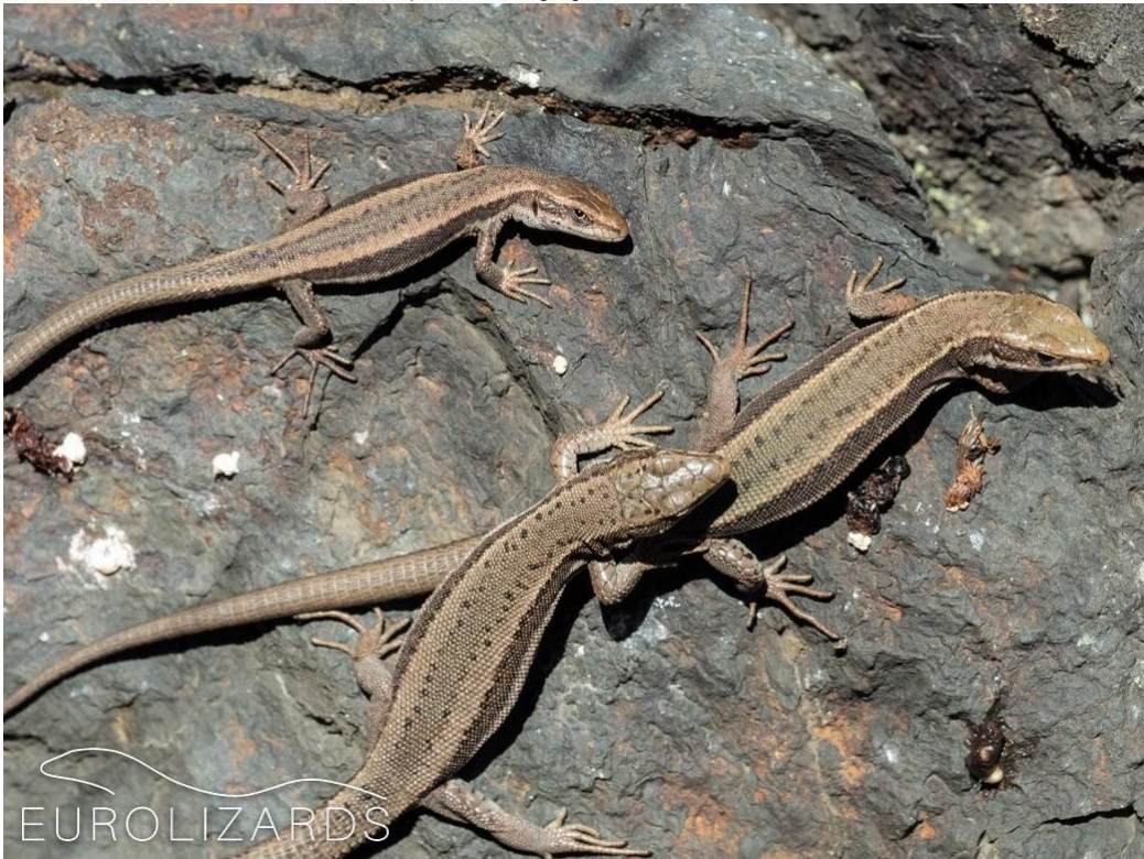
E / Val d'Aran, 23.08.2016 - Three Aran Rock Lizards warming up in the morning sun.