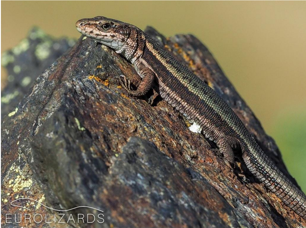
E / Val d'Aran, 23.08.2016 - An adult male basking on a rock.