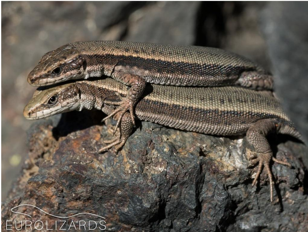
E / Val d'Aran, 23.08.2016 - Male on top, female below. Note the characteristic three large masseteric scales.

The Aran Rock Lizard is a lovely animal: These Lacertids use basking as part of their social life. They can be seen basking pairwise or in small groups - unlike other lizards, they even seem to enjoy physical contact. Although population densities may be high in suitable habitats, intraspecific aggression seems to be moderate: We saw two adult males alternately basking on the same stone (see pictures below).