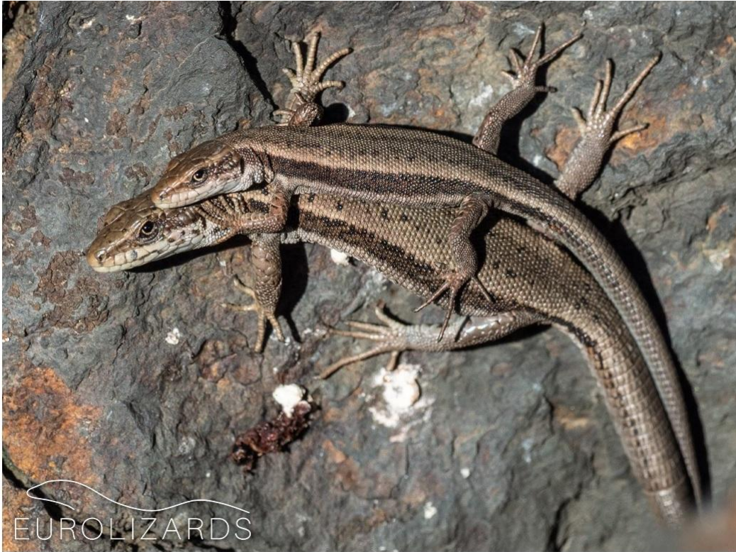
E / Val d'Aran, 23.08.2016 - Female and subadult specimen basking together.