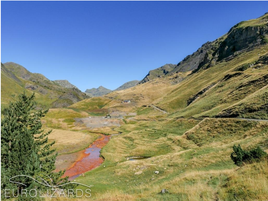
Habitat of Iberolacerta aranica near Baguerge (Val d'Aran / Spain).