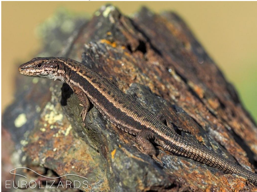
E / Val d'Aran, 23.08.2016 - Another male basking on the same rock as the one above.