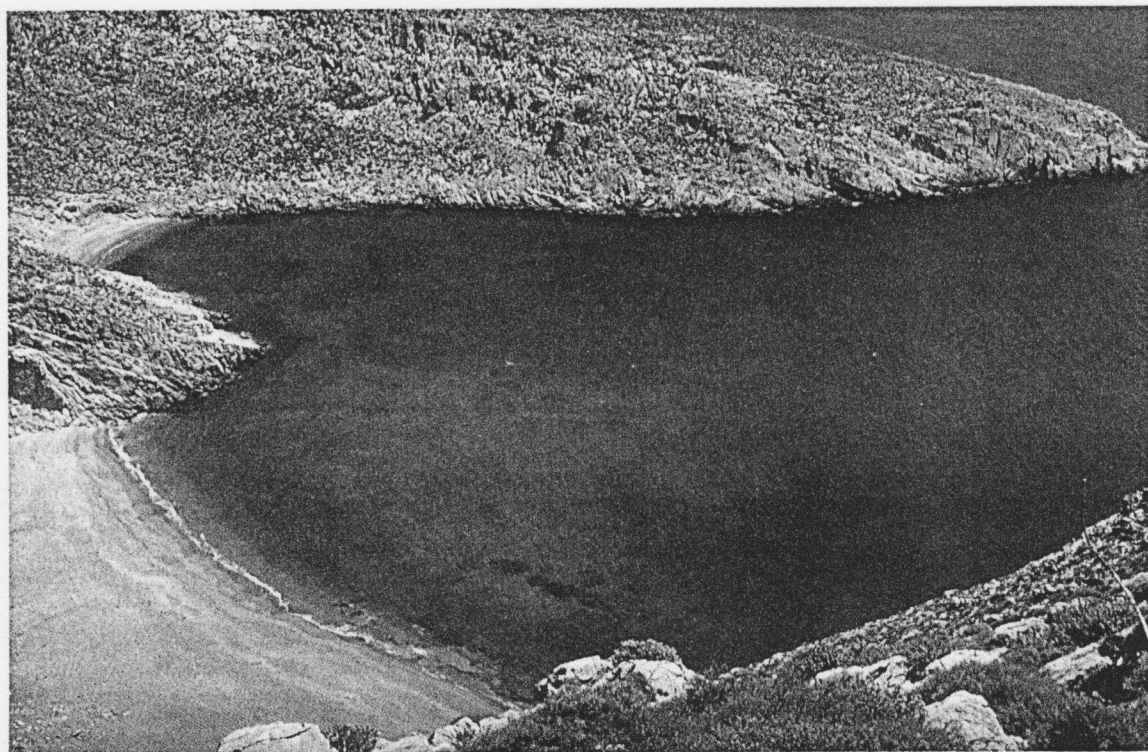
Plate 2. A typical nesting site of Caretta caretta in a beach of Astipálaia Island.