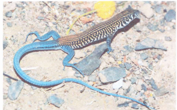
Nucras livida , juvenile—Farm Tierberg, NE of Prince Albert, WC