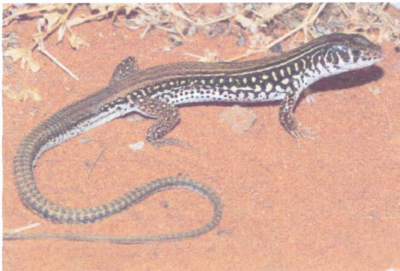
Nucras livida , adult—About 28 km SE of Britstown, NC

Conservation measures: None recommended.