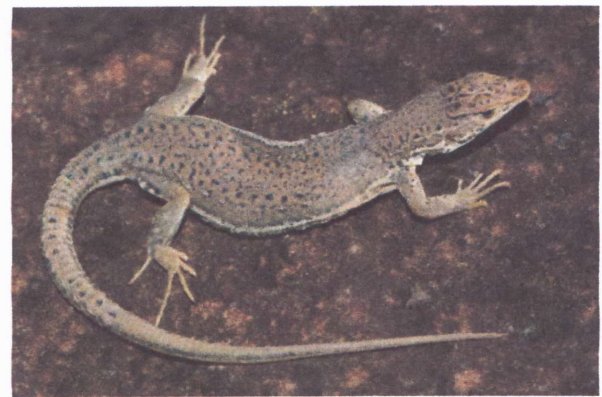
Pedioplanis burchelli , adult—Fever village, about 25 km SW of Cedarville, EC M. Burger