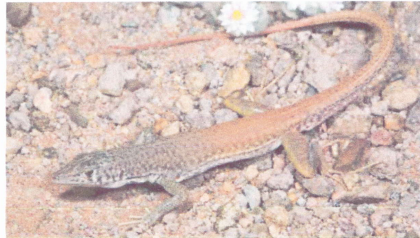
Pedioplanis inornata —near Potjiespram, Richtersveld, NC