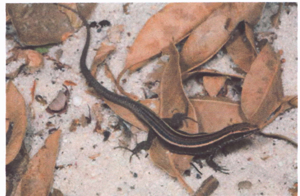
Vhembelacerta rupicola —Soutpansberg, LIMP