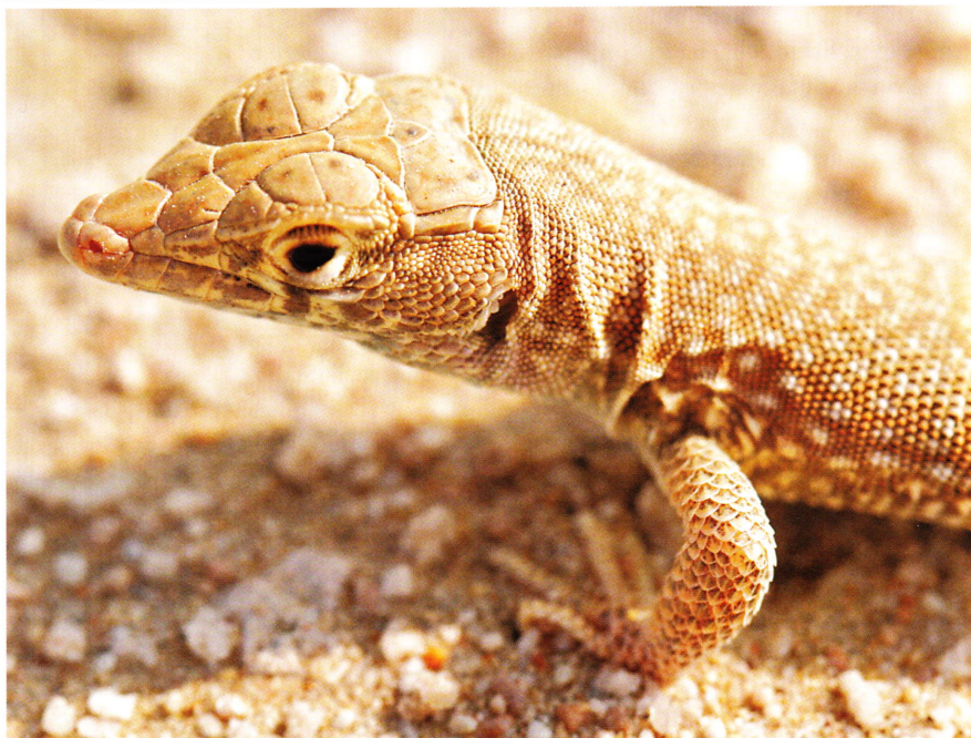
Figs. 225–226: Acanthodactylus schmidti near Dubai, UAE.