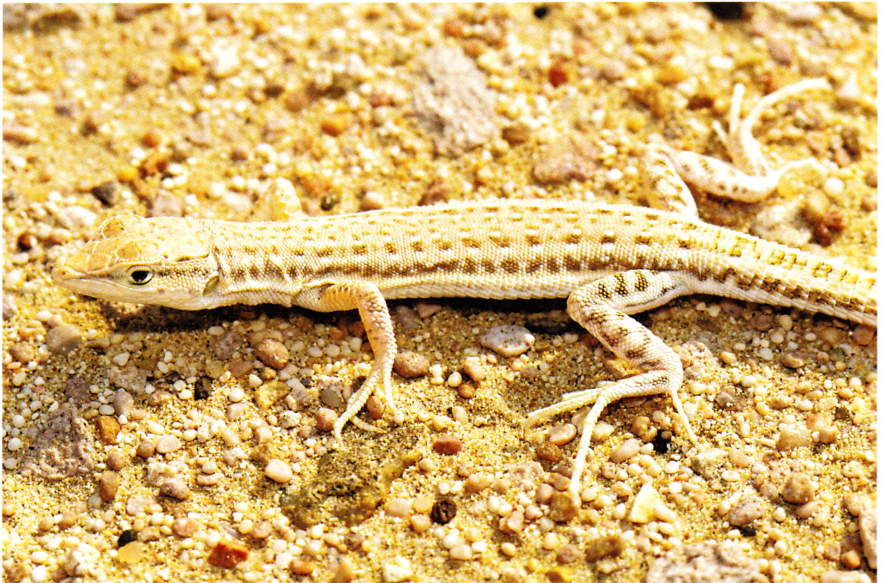
Fig. 228: Mesalina adramitana near Dubai, UAE.