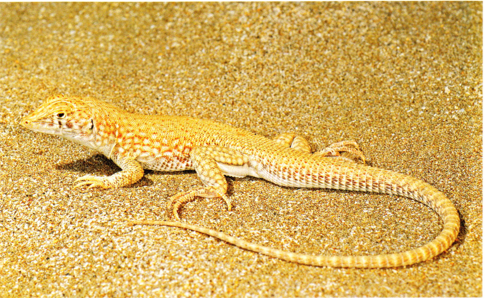
Fig. 227: Acanthodactylus schmidti male, Wahiba Sands, Sharqiyah, Oman.