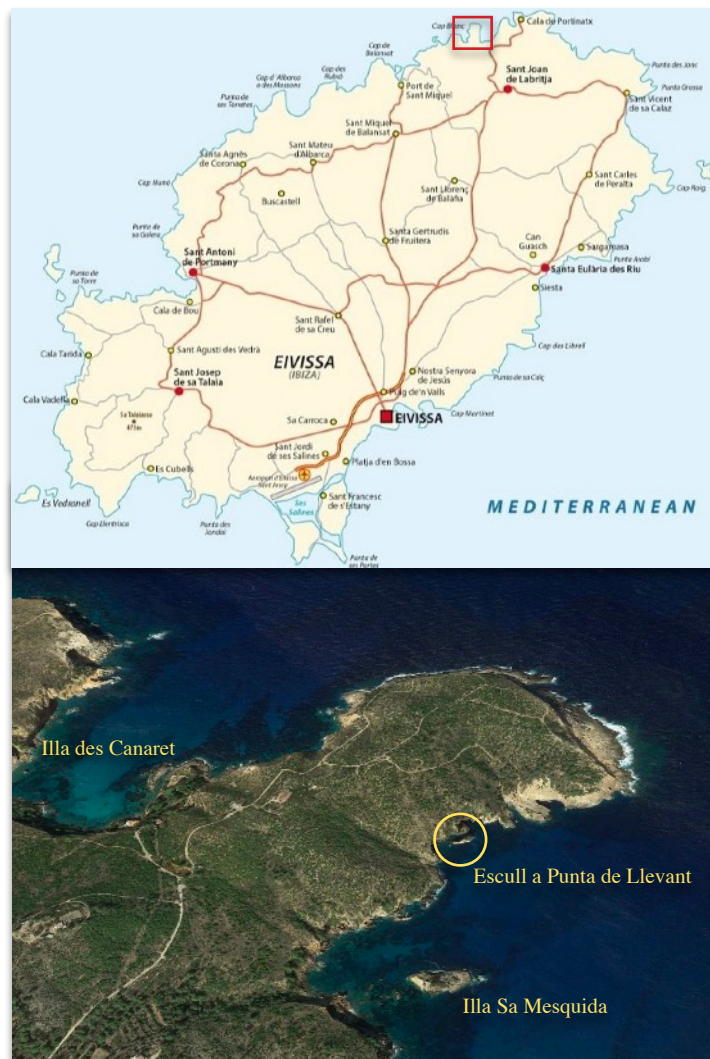
Image 2. Situation around Punta de Llevant, in the North of Ibiza.

The sighting and evaluation of the video footage made by the drone during the flights to one of the small islands in the North of Ibiza had a surprise in store for us. In the first instance our aim had been to investigate whether there was a vegetation present on the small islets. If this was the case, we tried to assess whether this island may host a small lizard population.