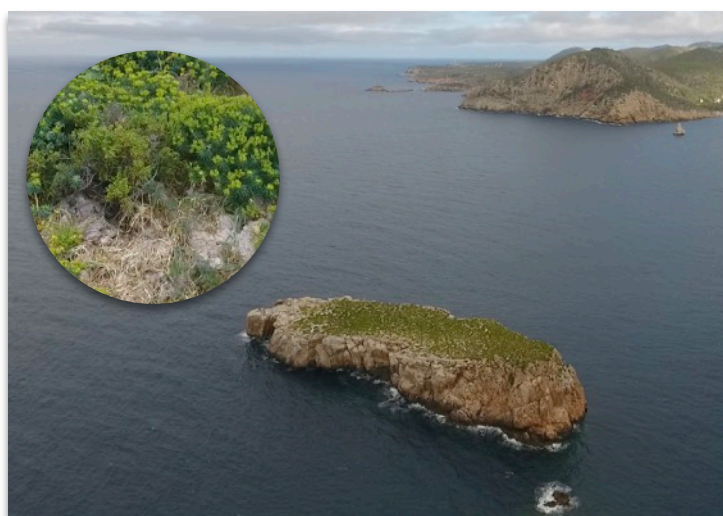
Image 1. Illa Murada in front of Port de Sant Miquel, with thriving Euphorbia marginaliana .

We believe that in this kind of monitoring a drone could perfectly replace the boots on the ground. By using a programmable flight route, standardization can be achieved, as a result of which the footage can be interpreted more easily, and as expected, also automatically.