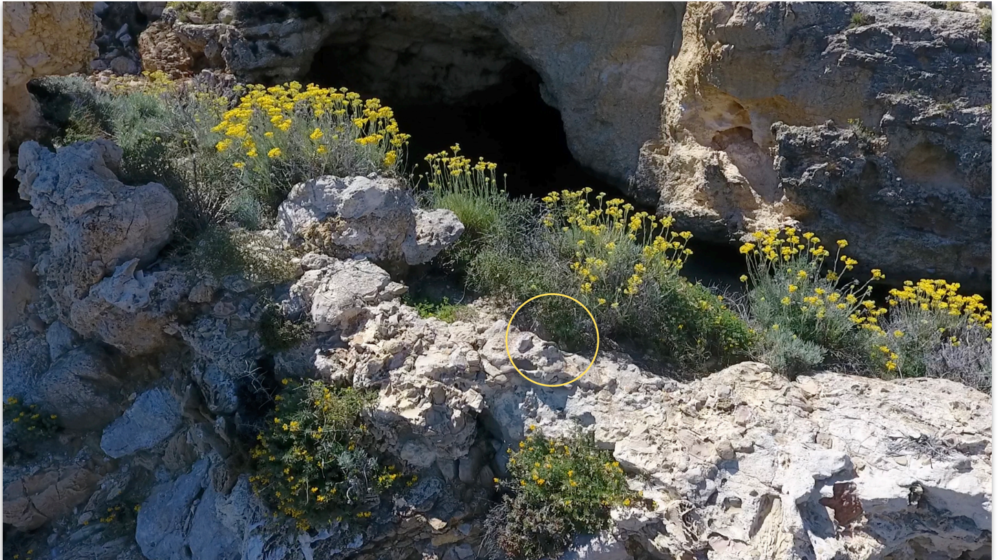
Image 3. The second lizard spotted on Escull a Punta de Llevant.