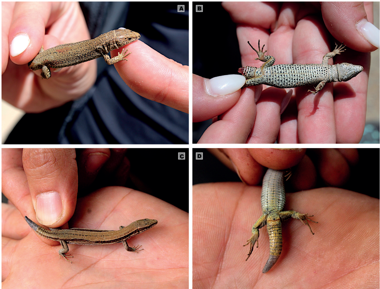
Figure 3. Male specimens of Atlantolacerta andreanskyi sampled in Toumliline (A, B) and Jbel Awlime (C, D).