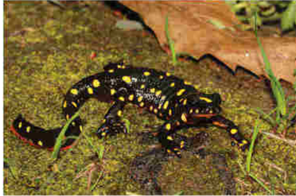
Fig. 44.10 Derjugin's Mountain Newt, Neurergus derjugini (Nesterov, 1916) Garmab, Western Baneh, Kurdistan Province, Iran.

Subspecies: N. d. derjugini , N. d. microspilotus