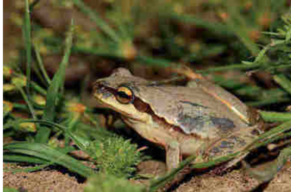
Fig. 44.6 Savigny's Tree Frog, Hyla savignyi Audouin, 1827 Kuna-Masi, Northern Sulaymaniah.

This species mostly inhabits in the vicinity of farms and residential regions, and found in marshlands, ponds, and small streams and can be seen numerous individuals on the roads surface at rainy nights. It lays eggs in wide strings.