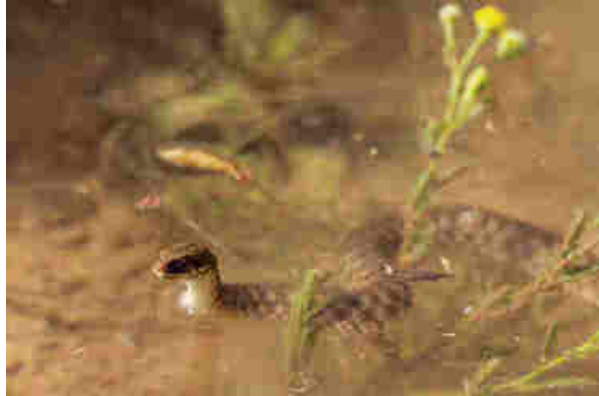
Fig. 44.14 Dice Snake, Natrix tessellata (Laurenti, 1768) Hur Al-Azim Wetland.