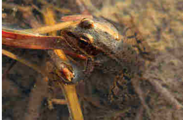
Fig. 44.7 Bedriaga's Frog, Pelophylax bedriagae (Camerano, 1882) Ranya, Northern Dukan Lake dam.

Large species with smooth or slightly rough dorsal skin, in a variety of colors from cream to green with irregular brown blotches and some of the individuals have a long green vertebral line. Males have two vocal sacs on either side of their head.