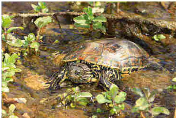
Fig. 44.13 Caspian Pond Turtle, Mauremys caspica (Gmelin, 1774) Karkheh river.