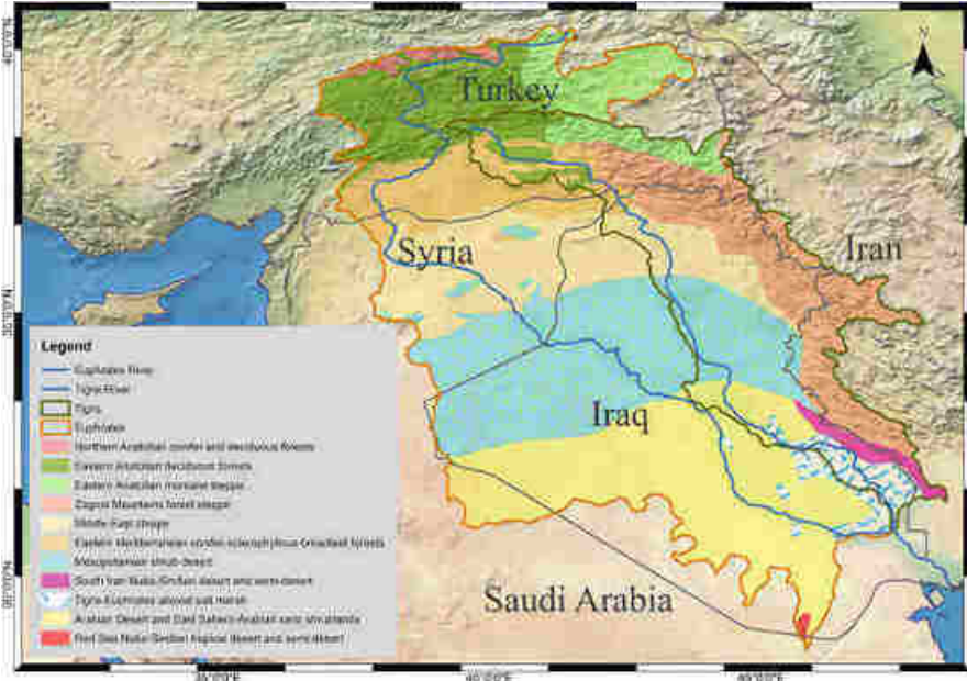
Fig. 44.3 Ecoregions of Euphrates and Tigris River Basin (based on UN-ESCWA and BGR 2013 and Olson et al. 2001)

(159,554 km 2 22.7%), the Middle East steppe (947,71 km 2 13.5%), the Northern Anatolian conifer and deciduous forests (5131 km 2 , 0.7%), the Southern Iran Nubio-Sindian desert and semi-desert (8779 km 2 , 1.3%), the Zagros Mountains forest steppe (81,047 km 2 , 11.5%).