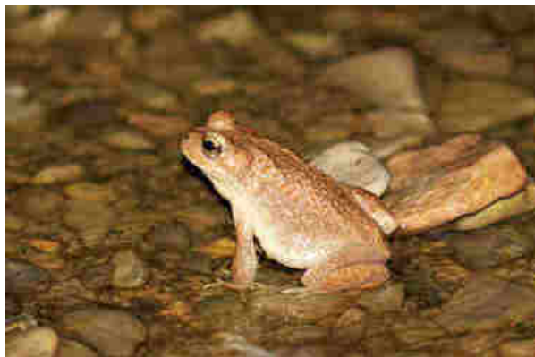
Fig. 44.4 Lorestan Melodious Toad, Calliopersa luristanica (Schmidt 1939) Bina & Bijar Protected Area, Ilam Province, Iran.

Conservation status: IUCN Red List: Least Concern