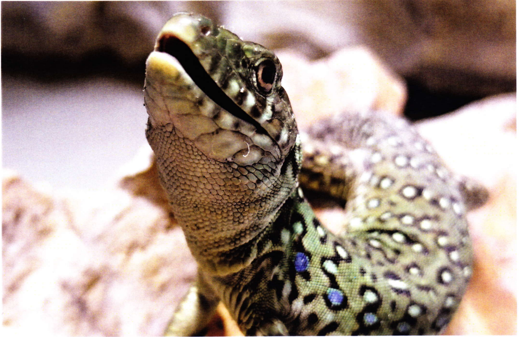
Figure 4 e. Baby Timon lepidus , close up.

conditions in the Quaternary period (MIRALDO et al. 2011). These refuges have led to the formation of evolutionary lineages of ocellated lizards by processes of population fragmentation, contraction and expansion. On the Iberian Peninsula the distribution of the different subspecies of Timon is relatively complex. Currently, three subspecies of T. lepidus are widely recognized; T. lepidus ibericus (LÓPEZ-SEOANE, 1884) in the north-western part of Portugal and Spain, T. lepidus oteroi (CASTROVIEJO & MATEO, 1998) from the island of Salvora and T. lepidus which inhabits the remainder of the distribution area. A recent study, (PEEK R., 2011), supported the hypothesis of a new T. lepidus subspecies found in Sierra de Gredos (Castilla y Leon, Spain) with similar features, but smaller in size (around 20 cm in maximum size).