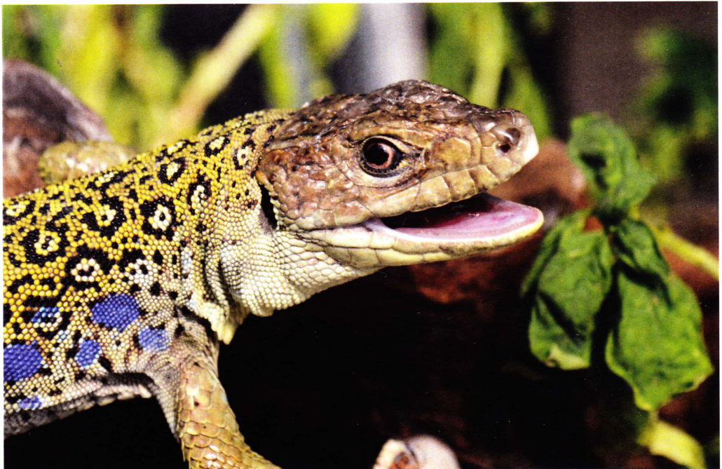
Figure 4 c. Timon lepidus , adult female, close up.

Recent phylogeographic studies have indicated that the Iberian Peninsula has been an important glacial refugium for the survival of ocellated lizards during adverse climate