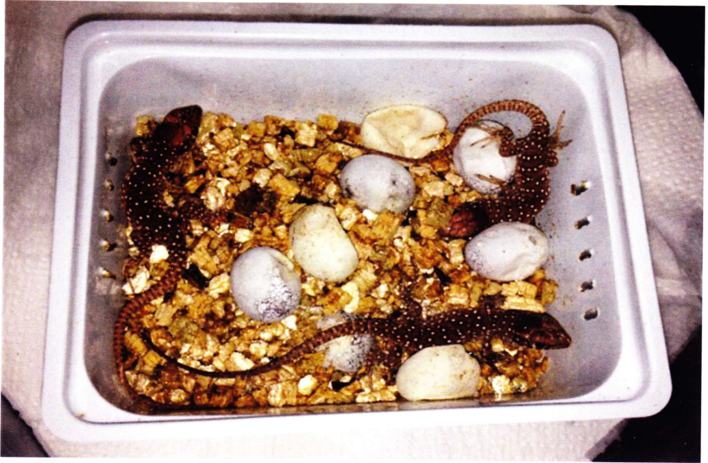
Figure 6. Just hatched Timon lepidus .