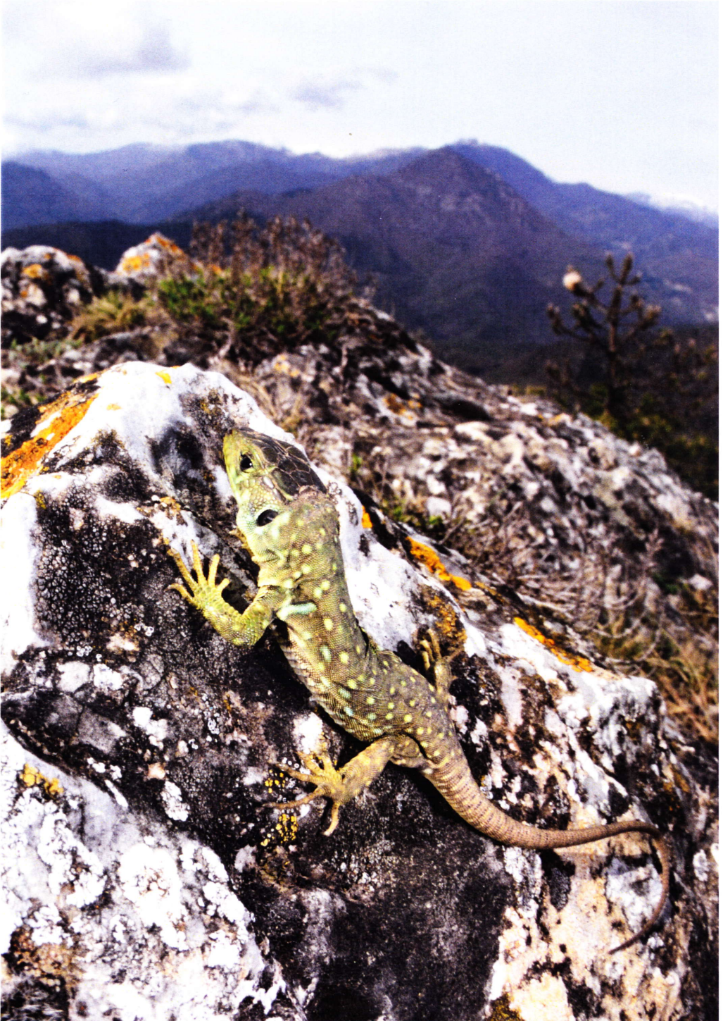
Figure 4 d. Baby Timon lepidus in his natural habitat, Liguria, Italy.