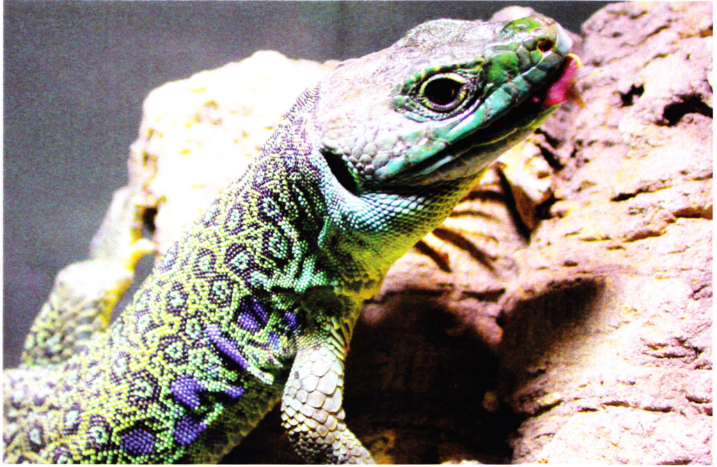
Figure 4 a. Timon lepidus , subadult male.