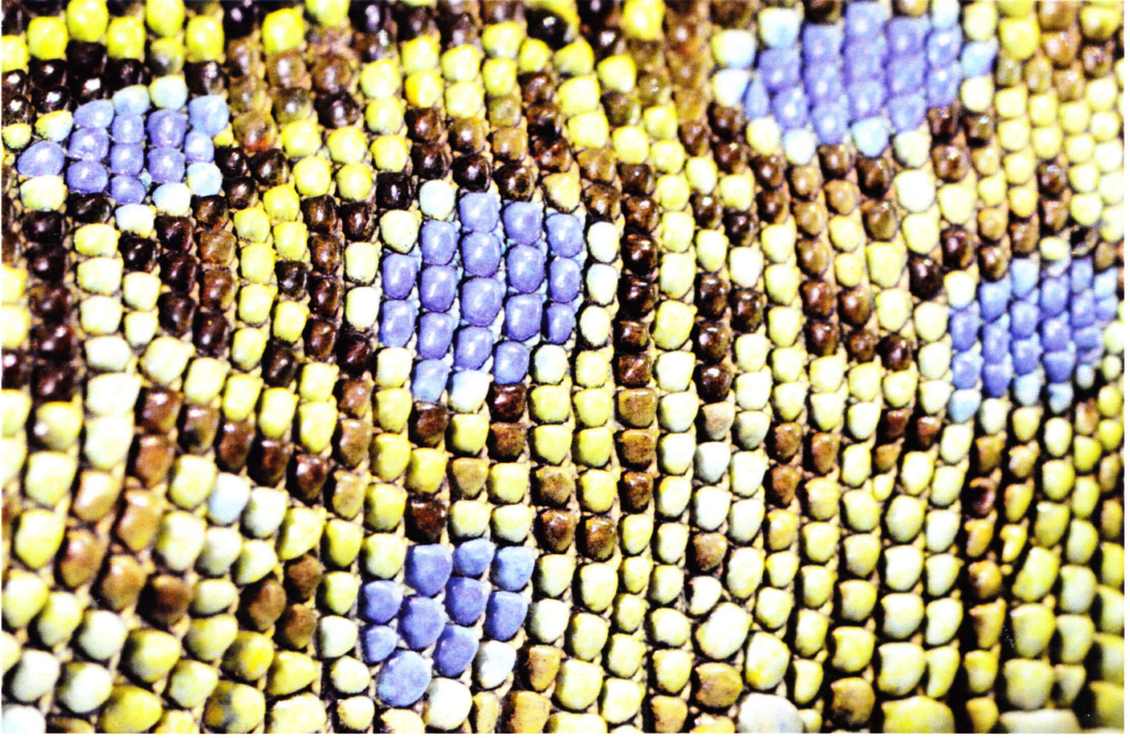
Figure 5 a. Timon lepidus skin, (adult male) close-up.