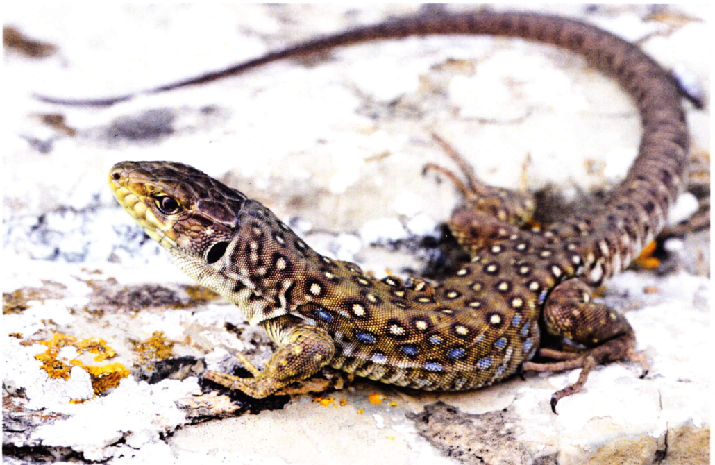
Figure 4 b. Young Timon lepidus , Liguria, Italy.