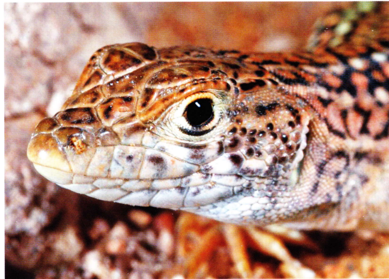
Fig. 448: Portrait of an adult male Acanthodactylus busacki . Tantan.

Identification: Medium-sized lizard usually larger than Acanthodactylus maculatus , sometimes exceeding 7 cm SVL (17 cm includ-