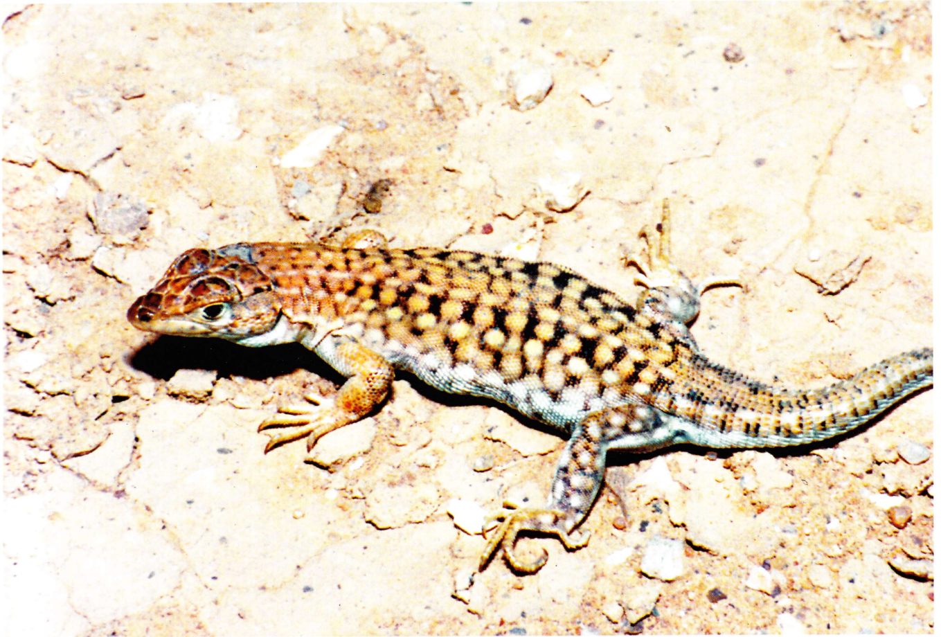
Fig. 451: Acanthodactylus busacki , adult female. Tantan.