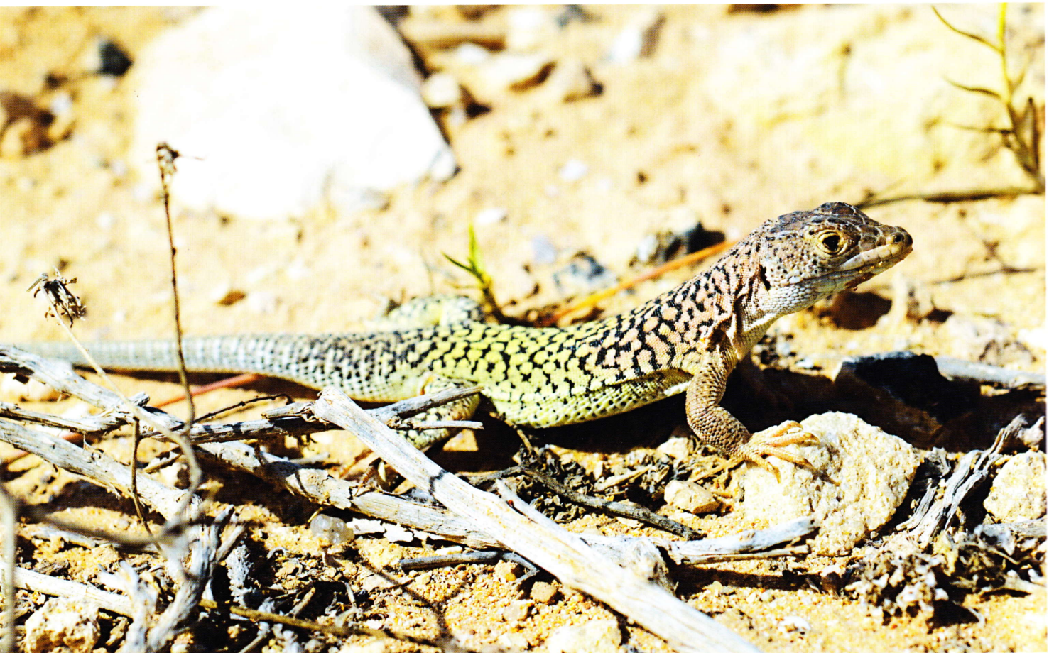
Fig. 450: Adult male of Acanthodactylus busacki from Boujdour.