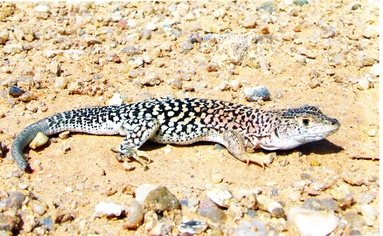
Fig. 449: Acanthodactylus busacki , adult male with regenerating tail. Boujdour.