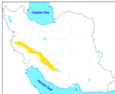
◁ Fig. 260: Timon kurdistanicus , Zagros Mountains.