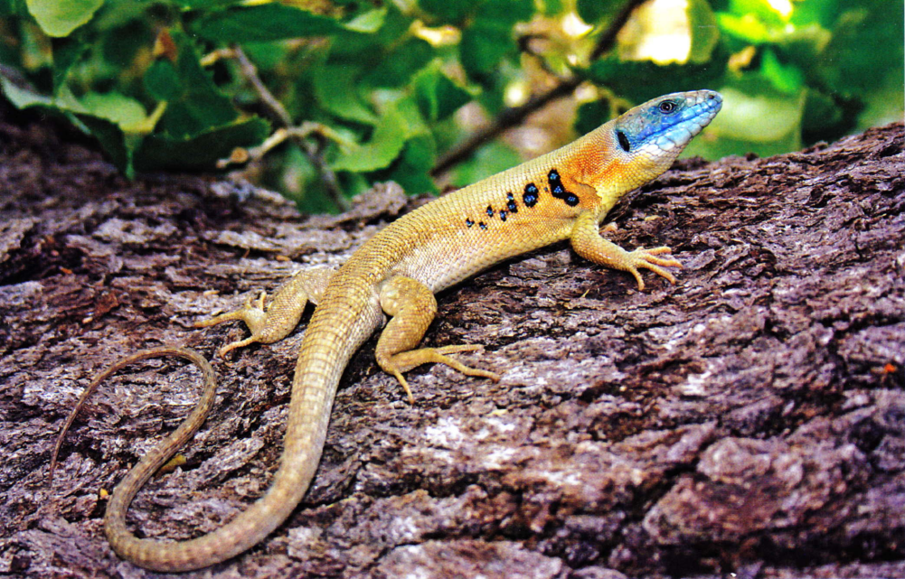
Fig. 261: Timon princeps , male. Males have blue heads, blue-centered black ocelli and a beige body. Kamran KAMALI