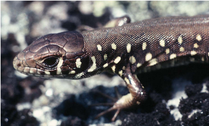
Lacerta schreiberi , juvenile.