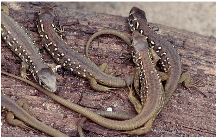
Lacerta schreiberi , juveniles.