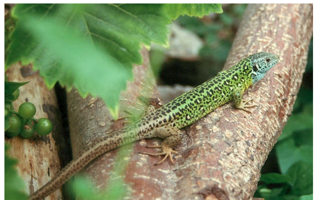
Lacerta schreiberi , male.