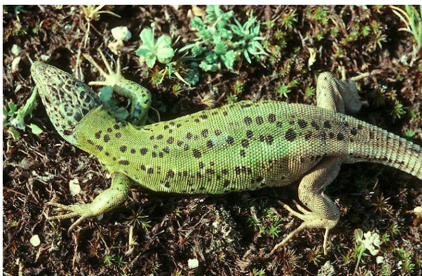
Lacerta schreiberi , female.

Juveniles are greenish brown with white or yellow dark-outlined spots. These spots sometimes remain visible throughout the first few years in females.