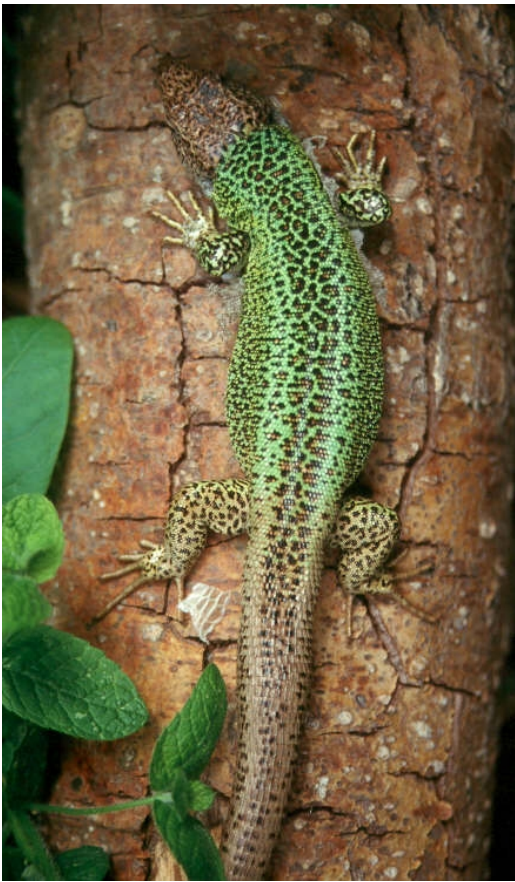
Lacerta schreiberi , male.