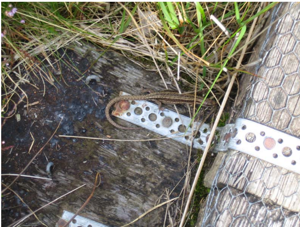
A common lizard sighted along a boardwalk at Glendalough, Co. Wicklow

The earliest sighting received was from the 19 th January 2007 where a homeowner found a lizard in his sitting room in Co. Tipperary. The latest record was on the 25 th October 2007 from Co. Donegal where the respondent came across a lizard behind some vegetation in his garden. Lizards are frequently seen in this garden basking on a stone wall.