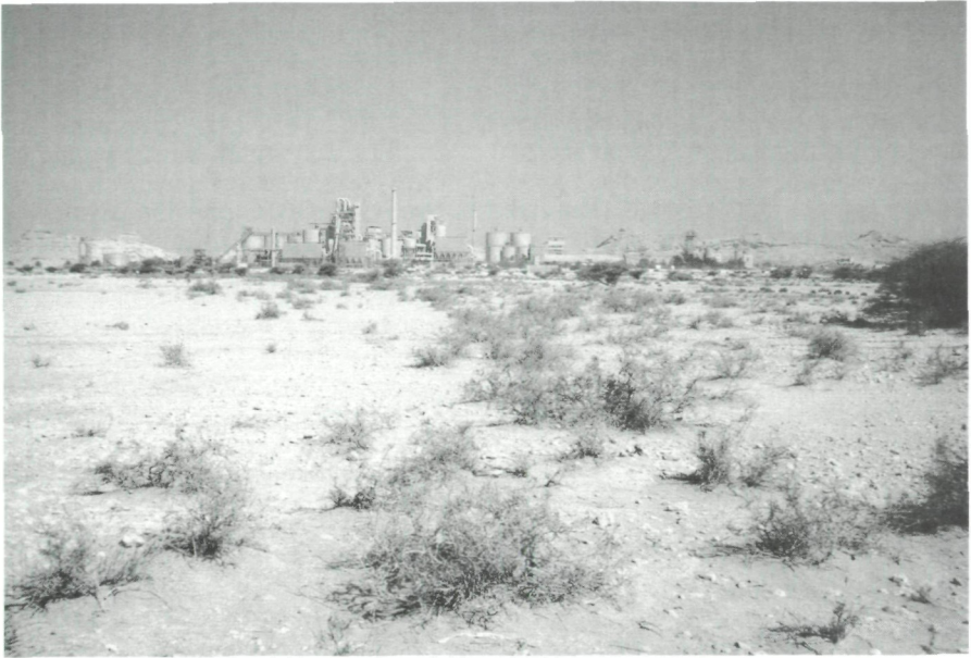
Fig. 1: Typical Acanthodactylus ophiodurus habitat dominated by Haloxylon salicornicum shrubs limited to the shallow drainage lines. Note the Al Ain Cement Factory in the background.

Abb. 1: Typisches Habitat von Acanthodactylus ophiodurus , dominiert von Haloxylon salicornicum Büschen, deren Vorkommen auf die seichten Senken beschränkt ist. Im Hintergrund die Zementfabrik von Al Ain.