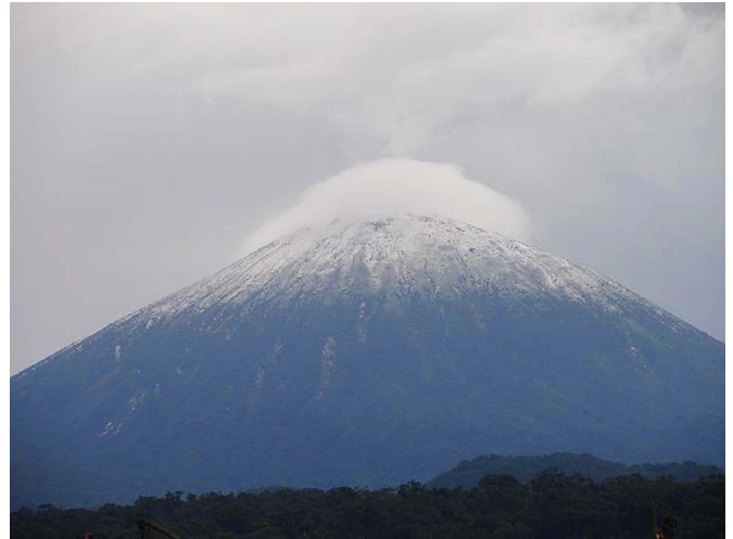
FIGURE 8. Summit of Mt. Karisimbi showing the results of a periodic ice/snow storm.

experiences what could be classified as "winter events" marked by snowfall and ice storms (Figure 8). Occasionally subfreezing temperatures extend far down the mountain's slopes at night. Since most species of chameleons sleep exposed on vegetation and this species exhibits this behavior, it is likely that C. rudis in the Virunga Mountains has the ability to supercool to avoid freezing to death. We found these chameleons in every vegetation zone and habitat within the park, although they exhibit a preference for sunlight openings and clearings in the forest, where they can bask cryptically in arboreal habitats to raise their body temperature (Figure 9). We encountered over 100 specimens in our surveys of the PNV.