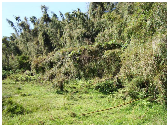
FIGURE 12. Horizontal bamboo stalks on edge of forest clearing in bamboo vegetative zone where Atheris nitschei illustrated in Figure 11 was found.