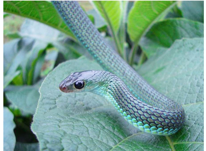
FIGURE 10. Adult Philothamnus ruandae .

we observed, one specimen was an adult sitting on a horizontal bamboo stalk about 2 m above ground at the edge of a swamp. Another was found on the ground at the edge of the same swamp. This swamp is at approximately 2,900 m in elevation. This represents the highest elevation that this species has been found. Like many species of herpetofauna found in the PNV, this species is an Albertine Rift endemic (Figure 10).