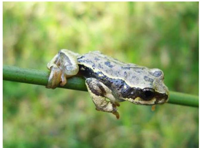
FIGURE 5. Juvenile Hyperolius castaneus .

This widely distributed species was another species of which we collected numerous individuals within the PNV. Adults were commonly collected in depression marshes and swamps. Juveniles and metamorphs were most common on sedge hummocks a few meters or more from standing water. This species is dimorphic as adults with the males being brown or green above with a light dorsolateral line and the females being green above and yellow on the venter with a dark line separating the two colors (Channing and Howell 2006) (Figure 6). Males can easily be confused in the PNV with adults of Hyperolius castaneus , but the dorsolateral line on a male H. castaneus is dark, while the line on a male H. cinnamomeoventris is light. We collected this species at localities up to 3200 m in the PNV.