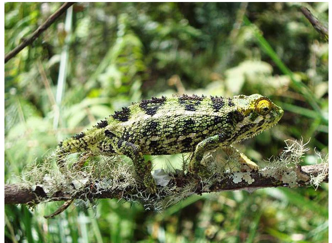
FIGURE 9. Adult Chamaeleo rudis .