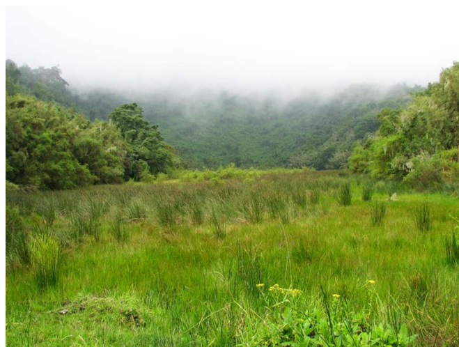
FIGURE 3. Flooded depression marsh at approximately 2,800 m in elevation. Hyperolius castaneus , Hyperolius cinnamomeoventris and Leptopelis karissimbensis were common at this site. Atheris nitschei , Philothamnus ruandae and Leptosiaophos graueri were also found at this site.