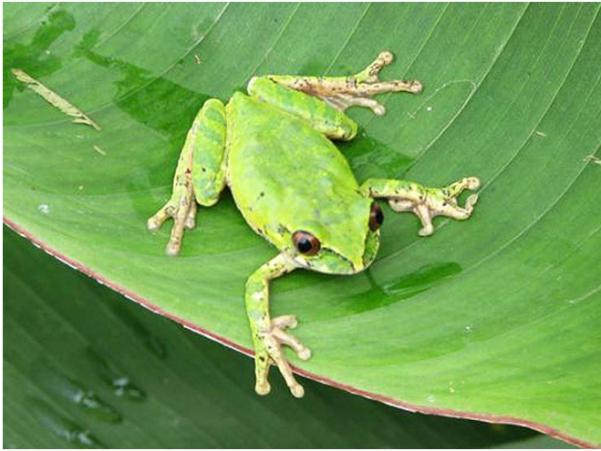
FIGURE 4. Adult Leptopelis karissimbensis .