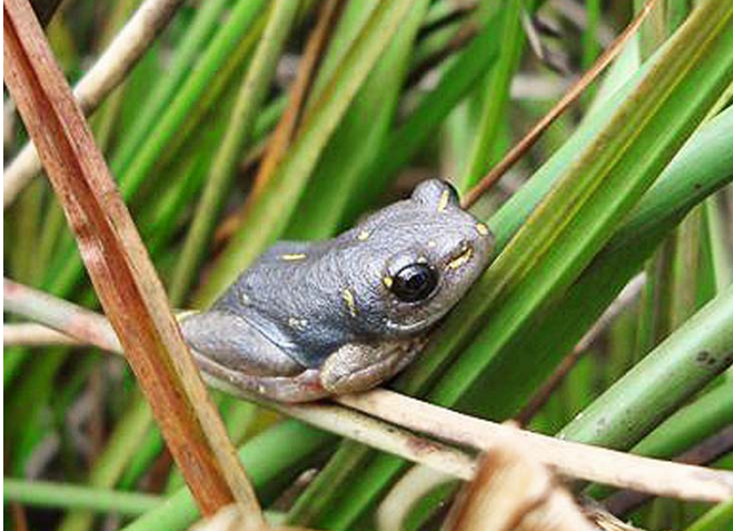
FIGURE 7. Adult Hyperolius viridiflavus .

m. Only adults were located, sometimes by the calling of males during the day. This is a forest species (Drewes and Vindum 1994) and it is likely that we could not locate individuals in thick forest because of their cryptic behavior and color pattern. While this species exhibits an amazing array of brilliant color patterns in other areas, individuals from the Virungas are dull grayish brown with yellow flecks on the dorsum and dark eyes (Figure 7).