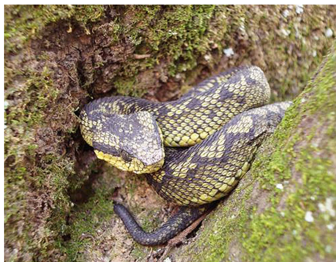
FIGURE 11. Juvenile Atheris nitschei .

the lower park boundary is much higher. The lowest park boundary in Rwanda is approximately 2600 m in elevation, while the lowest park boundary in DRC is approximately 1900 m in elevation. This is important, because true montane forest communities do not usually exist in this region above about 2500 m. There is virtually no true montane forest left within the park boundaries of the PNV, and consequently, reptile and amphibian diversity is much lower in the PNV than other forested Albertine Rift areas in close proximity. Two of these areas in Uganda, Bwindi Impenetrable National Park and Kibale National Park, have had excellent surveys conducted for the presence of herpetofaunal diversity (Drewes and Vindum 1994; Vonesh 2001). Drewes and Vindum (1994) reported thirty-six reptile and twenty-nine amphibian species from Bwindi Impenetrable National Park (BINP), whose closest border to the PNV in Rwanda is only about 35 kilometers straight line distance to the North. Approximately 140 km North of the PNV, Vonesh (2001) reported fifty-three species of reptiles and thirty species of amphibians from Kibale Forest in Kibale National Park. Both of these parks are significantly lower in elevation than the PNV. The highest elevations in BINP are approximately 2600 m in elevation and are approximately 1600 m in elevation in Kibale National Park, but most of the area of both parks