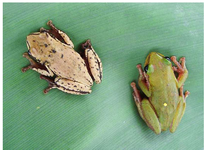
FIGURE 6. Adult male and female Hyperolius cinnamomeoventris ; showing sexual dimorphism.