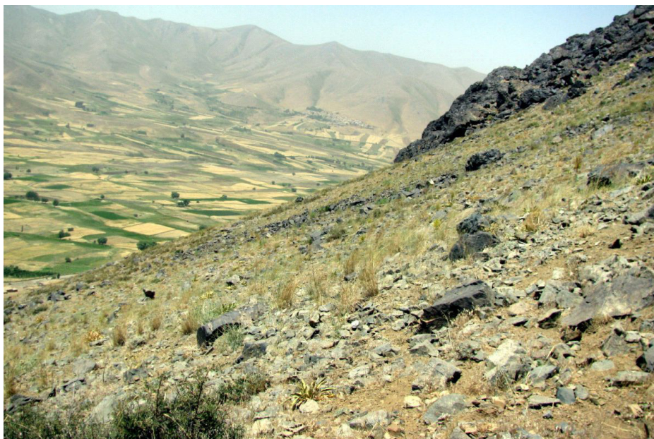
Figure 2. The natural habitat of Eremias (Eremias) montanus (new record) in Badr and Parishan highlands, at about 2466 m elevation.