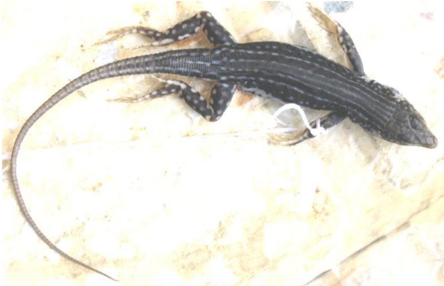
Figure 3. Dorsal view of the collected specimen of Eremias (Eremias) montanus .

stripe bifurcating on the nape, a single paravertebral stripe on each side and two dorsolateral stripes containing light spots; venter dirty-white; the proximal lower caudal region being whitish-gray, becoming lighter distally. The collected specimen is preserved in 75% alcohol and is deposited at the collection of the Razi University Zoological Museum (RUZM-LE30.7) (Fig. 3).