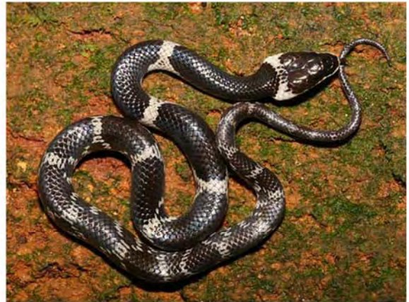
Fig. 14: Lycodon striatus