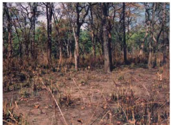
Fig. 26: Man made fire