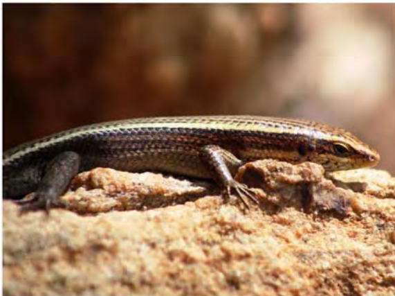
Fig. 21: Eutropis beddomii