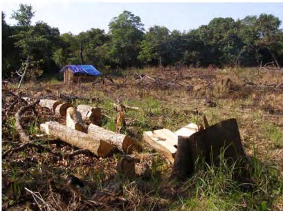
Fig. 23: Illegal logging