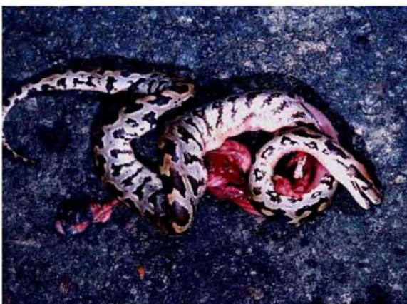
Fig. 25: Road kills