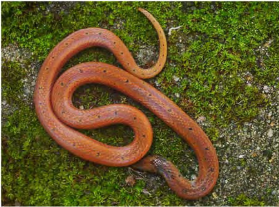
Fig. 11: Aspidura brachyorrhos