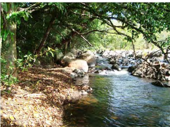
Fig. 09: Streams