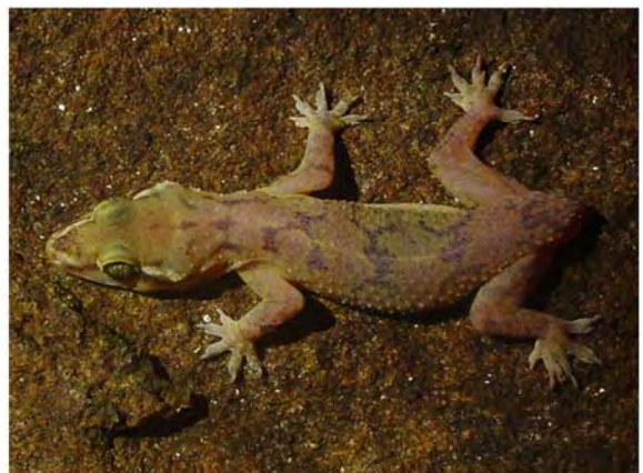
Fig. 18: Hemidactylus depressus