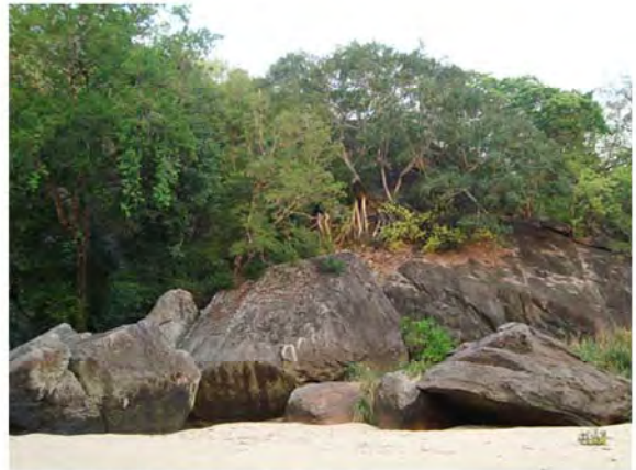
Fig. 06: Rock-outcrops