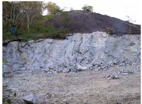
Fig. 24: Granite rock blasting