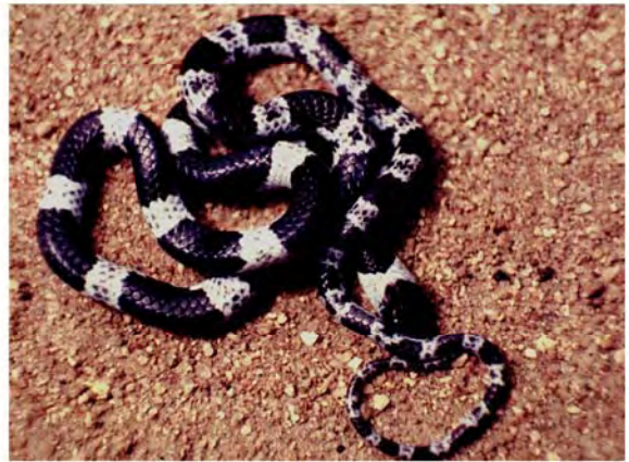
Fig. 12: Dryocalamus nympha