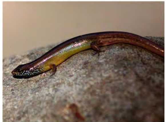
Fig. 22: Lankascincus fallax