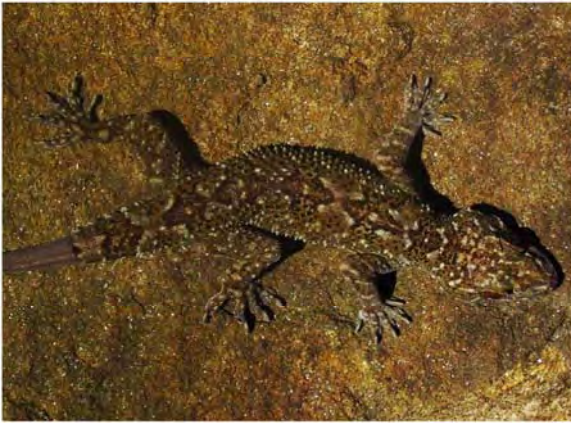
Fig. 19: Hemidactylus hunae