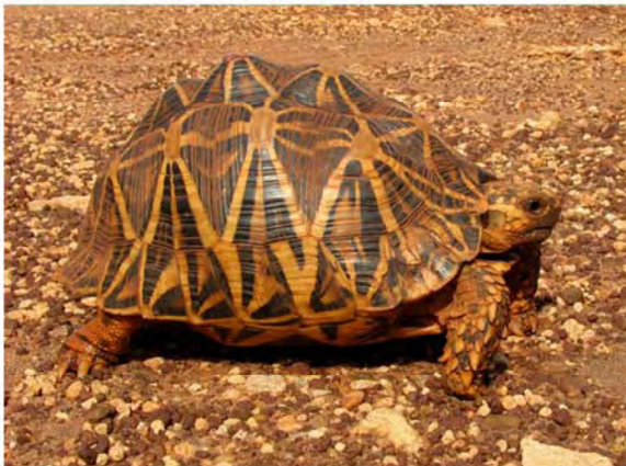
Fig. 15: Geochelone elegans