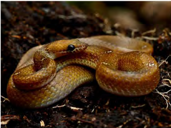
Fig. 13: Lycodon osmanhilli