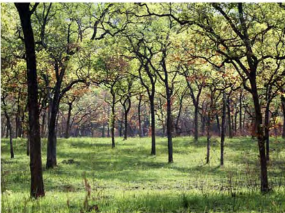
Fig. 07: Savannah forests