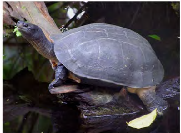
Fig. 16: Melanochelys trijuga