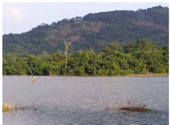
Fig. 10: Tanks