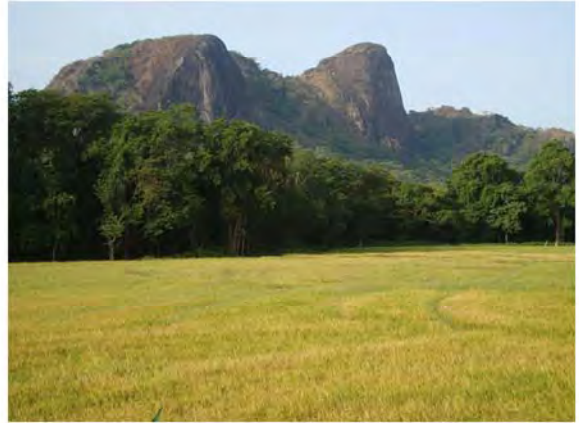
Fig. 04: Paddy fields