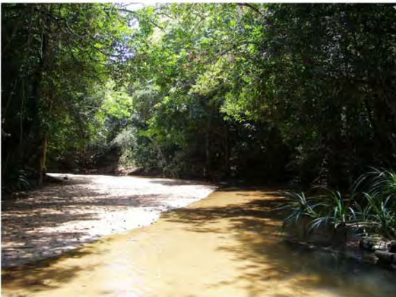
Fig. 05: Riverine forests