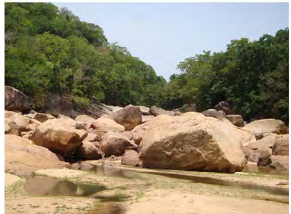
Fig. 08: Small Ponds