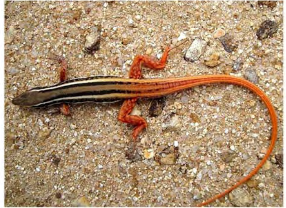
Fig. 20: Ophisops leschenaulti lankae