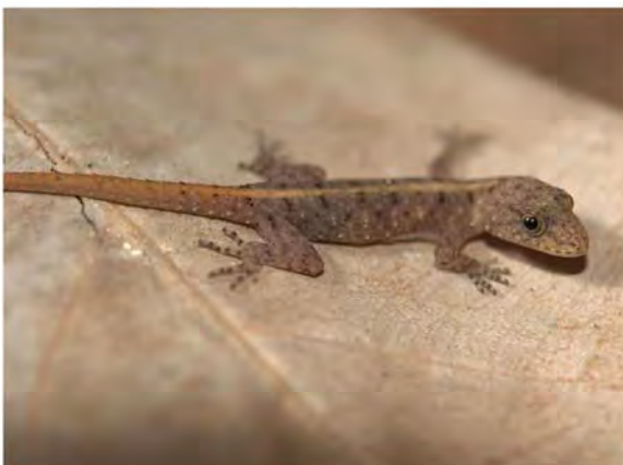
Fig. 17: Cnemaspis cf. tropidogaster