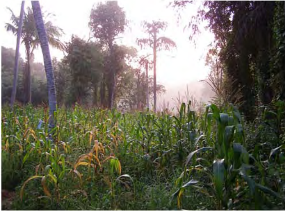
Fig. 03: Chena cultivations