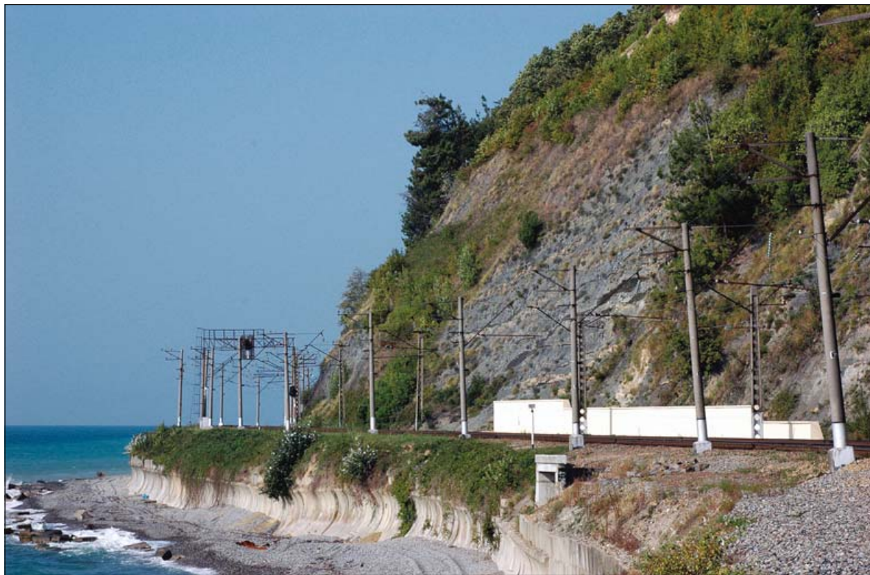
Fig. 13. Seashore with railway between Zubova Shchel' and Matrosskaya Shchel'.

D. b. darevskii in broadleaf mesophyllous forests of Western Caucasus.