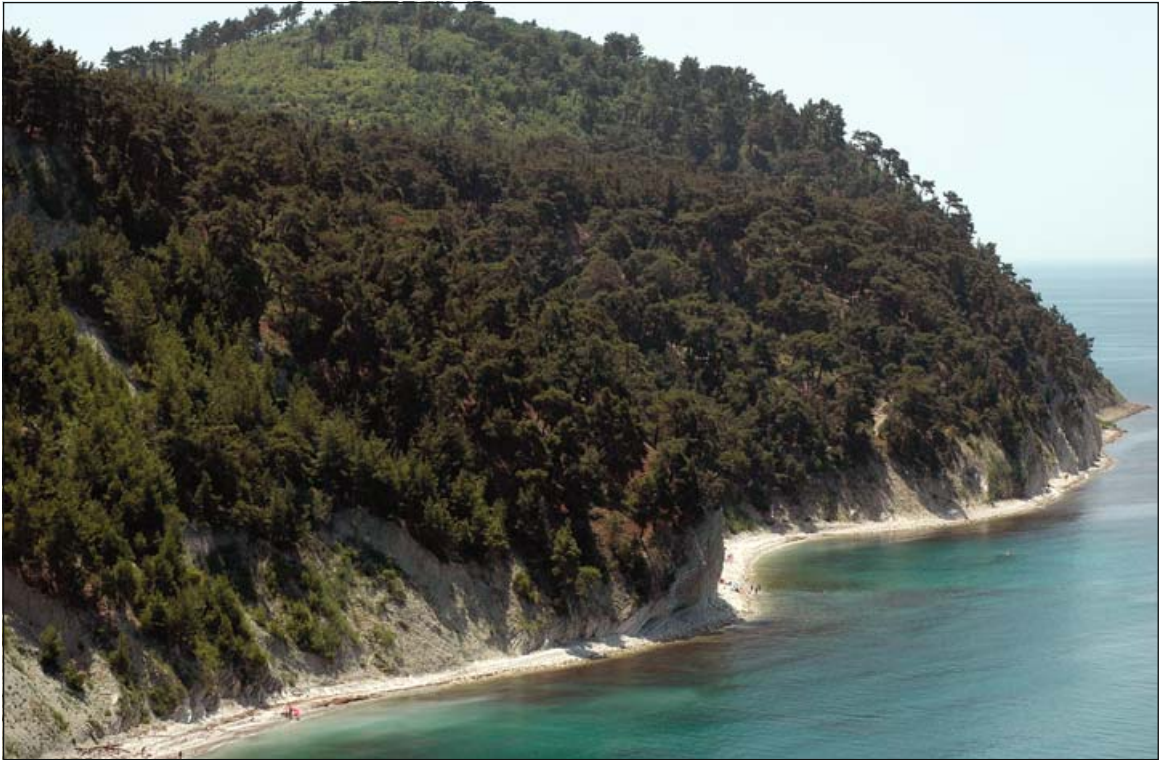
Fig. 4. Habitats of D. szczerbaki on living cliff of cape Dzhankhot.