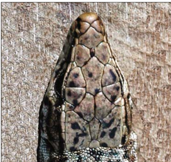
Fig. 8. Intercalary shields between prefrontals in D. saxicola from one of westernmost population in Marinskiy Pass (No. 1463 SNP).

D. b. szczyrbaki as it was supposed by Darevsky (1967). Records of Lacerta saxicola in the belt of broadleaf (oak-beech) forests of Ridge Navagir (Tsellarius and Tsellarius, 2001a; 2001b; Tsellarius, 2005) according to personal communication of A. Yu. Tsellarius, also belongs to D. b. darevskii .