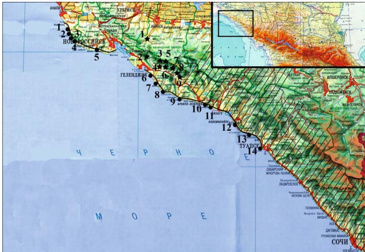
Fig. 6. Distribution of Darevskia szczerbaki and D. brauneri after the data field seasons of 2008 – 2010. Darevskia szczerbaki , dots: 1, vicinity of Anapa; 2, Cape Bol'shoy Utrish; 3, vicinity of Shirokaya Shchel'; 4, Cape Malyy Utrish; 5, Mokraya Shchel' and lake Limanchik at Dyurso Settlement; 6, vicinity of Gelendzhik; 7, vicinity of Dzhankhot Settlement; 8, Cape Idokopas; 9, vicinity of Betta Settlement; 10, Gulf Inal; 11, vicinity of Bzhid Settlement; 12, vicinity of Novomikhailovskiy Settlement; 13, Village Sosnovoye at Agoy Settlement; 14, Cape Kadosh near Tuapse. D. brauneri : stripes, known area; stars, new localities: 1, Village Shapsugskaya; 2, north slope of Markhot Ridge above Kabardinka Settlement; 3, Botsekhur Mountain; 4, Aderba River; 5, Shebs River; 6, Achibs River; 7, Zhene River; 8, Kozach'ya Mountain; 9, Temnaya Shchel'.

southward to Tuapse, i.e., in the area with suitable biotopes (Tuniyev, 2003). In this context it is interesting to note the records in 2009 in a vicinity of village Sosnovoye (Tuapse Rayon), and in 2010 in vicinity of settlement Novomikhailovskiy and in Cape Kadosh near Tuapse town. Furthermore D. b. szczerbaki was noted by us practically along all marine cliff from type locality in north-west to the environs of Tuapse in southeast (Figs. 4 and 5).