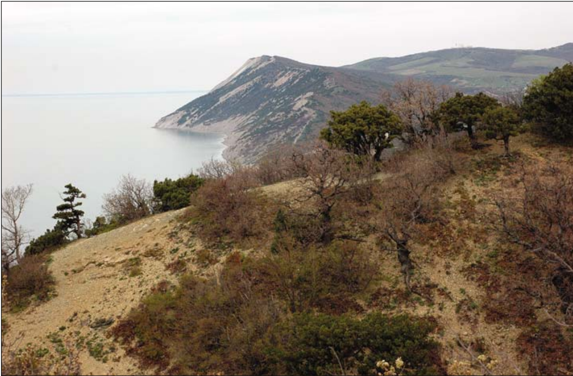
Fig. 2. Habitats of D. szczerbaki on living cliff of cape Bol'shoi Utrish and Sukko seashore.