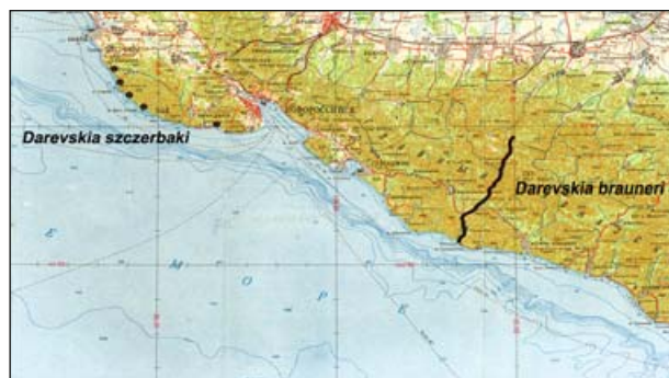
Fig. 1. Distribution of Darevskia brauneri szczerbaki and D. brauneri darevskii in North-Western Transcaucasia after literature dates.

Material was collected in 1987–2010 along both macro slopes of North-Western Caucasus from town Anapa south-eastward to Sochi. A total of 139 specimens of both forms were studied. Given the rarity of Darevskia brauneri szczerbaki (recorded in 2007 in the Red Book of Krasnodar Territory), collecting of this form was limited and consisted of 27 specimens from 7 localities (Table 1). Additionally 23 specimens of Darevskia saxicola from 3 westernmost localities were examined. Samples are stored in the collection of the Scientific Department of the Sochi National Park. Material has been studied by