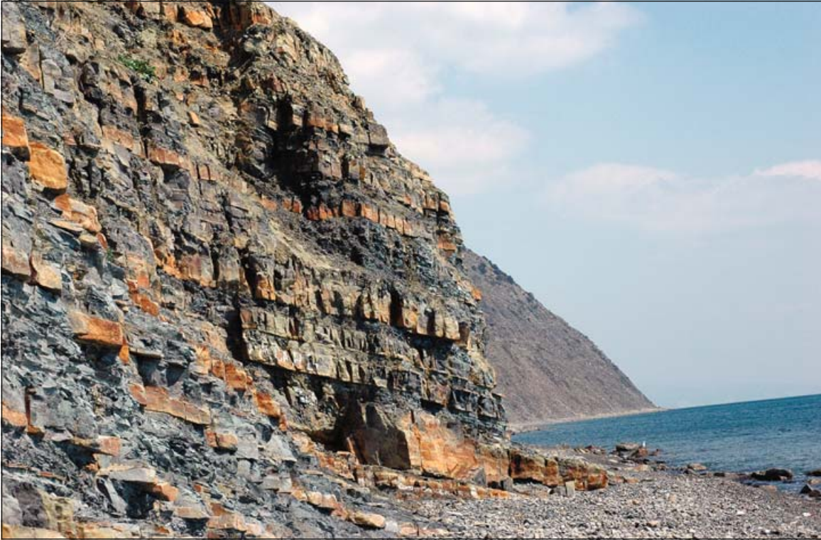
Fig. 3. Habitats of D. szczerbaki on rocks near Limanchik.