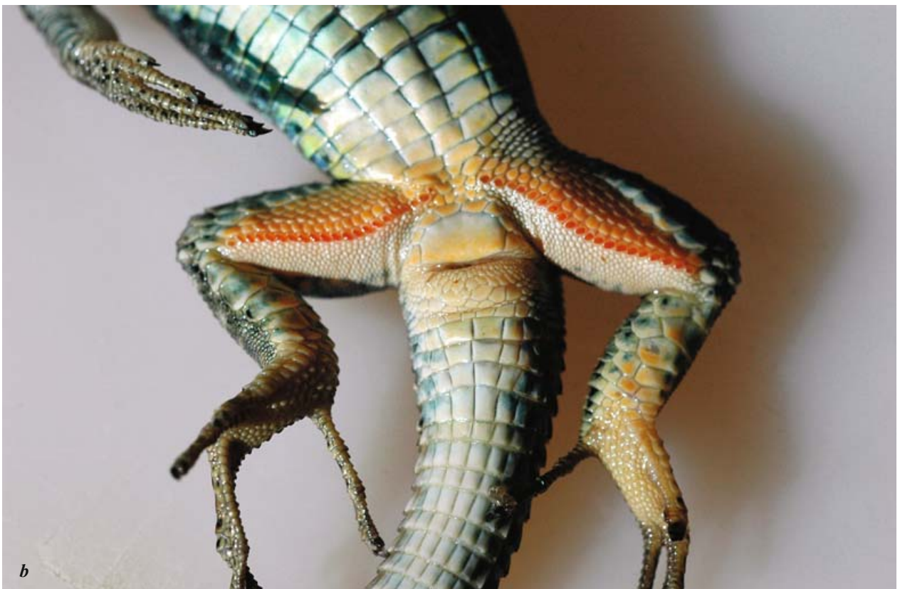
Fig. 9. In Spring D. szczerbaki is characterize by sandy-gray upper color of the body (a) and yellow-orange color of thighs with darker femoral pores (b).