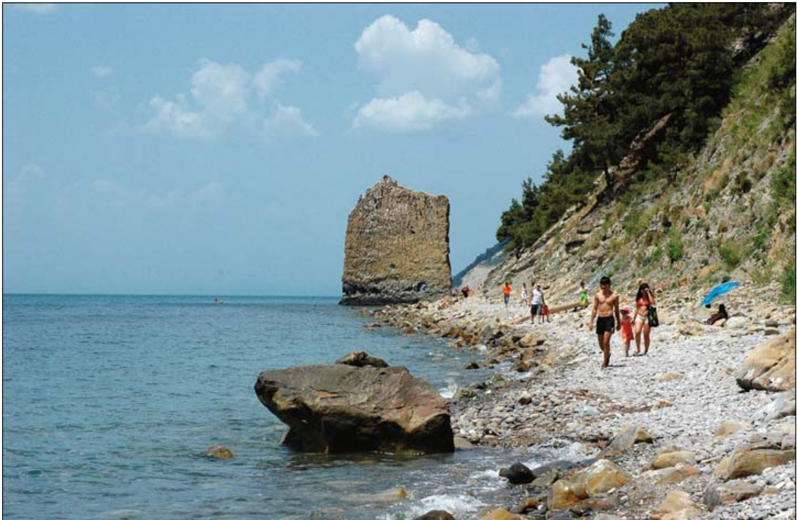
Fig. 5. Habitats of D. szczerbaki at Rock Parus near Praskoveevka settlement.