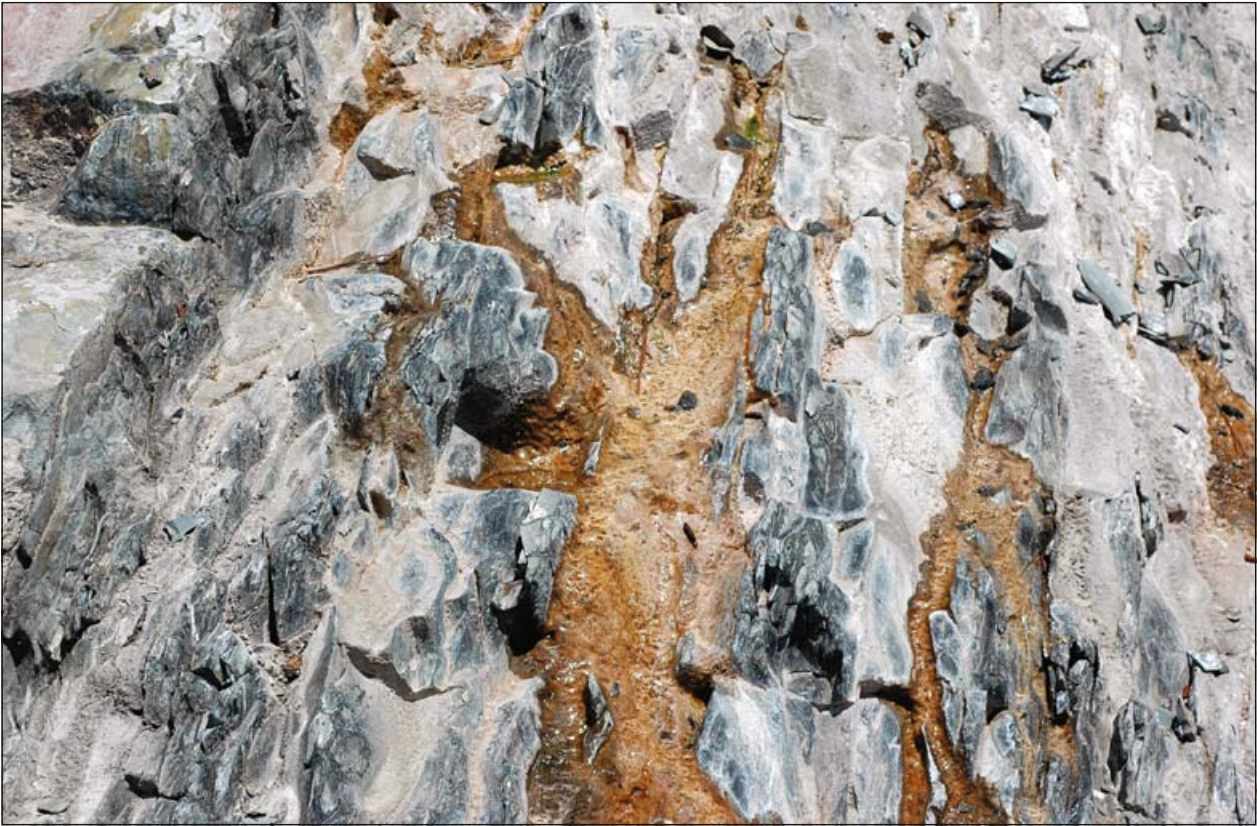
Fig. 14. Small constant springs of fresh waters are an original centers of micropopulations of D. szczerbaki .