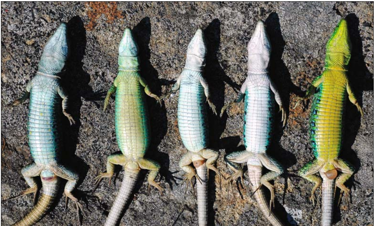
Fig. 11. Ventral coloration of D. braueri .