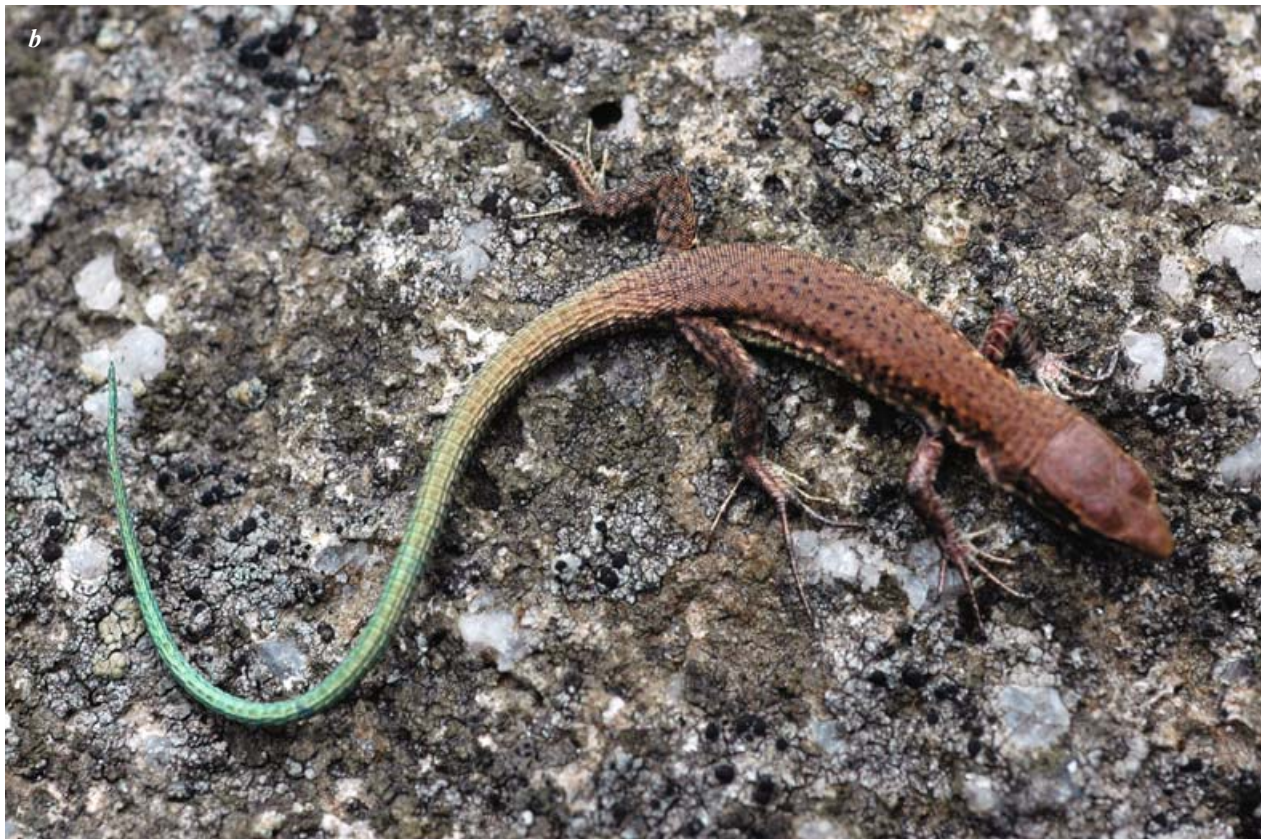
Fig. 12. Coloration of juveniles: a , gray in D. szczerbaki ; b , brawn in D. brauneri .