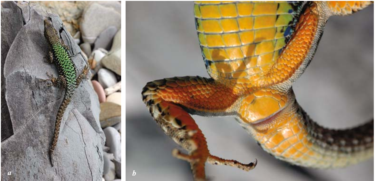
Fig. 10. In Summer males of D. szczyrbaki is characterize by greenish or green upper color of the body (a) and yellow belly with dark-orange color of thighs and femoral pores (b).