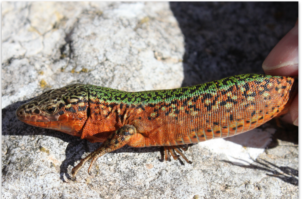
Image 4. Male Podarcis pityusensis at Illa Redona de Santa Eulària.