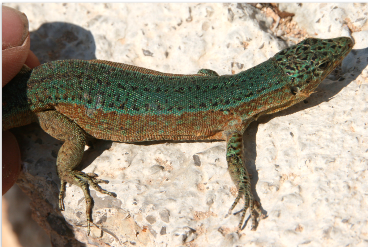
Image 17. Male Podarcis pityusensis at Tagomago.