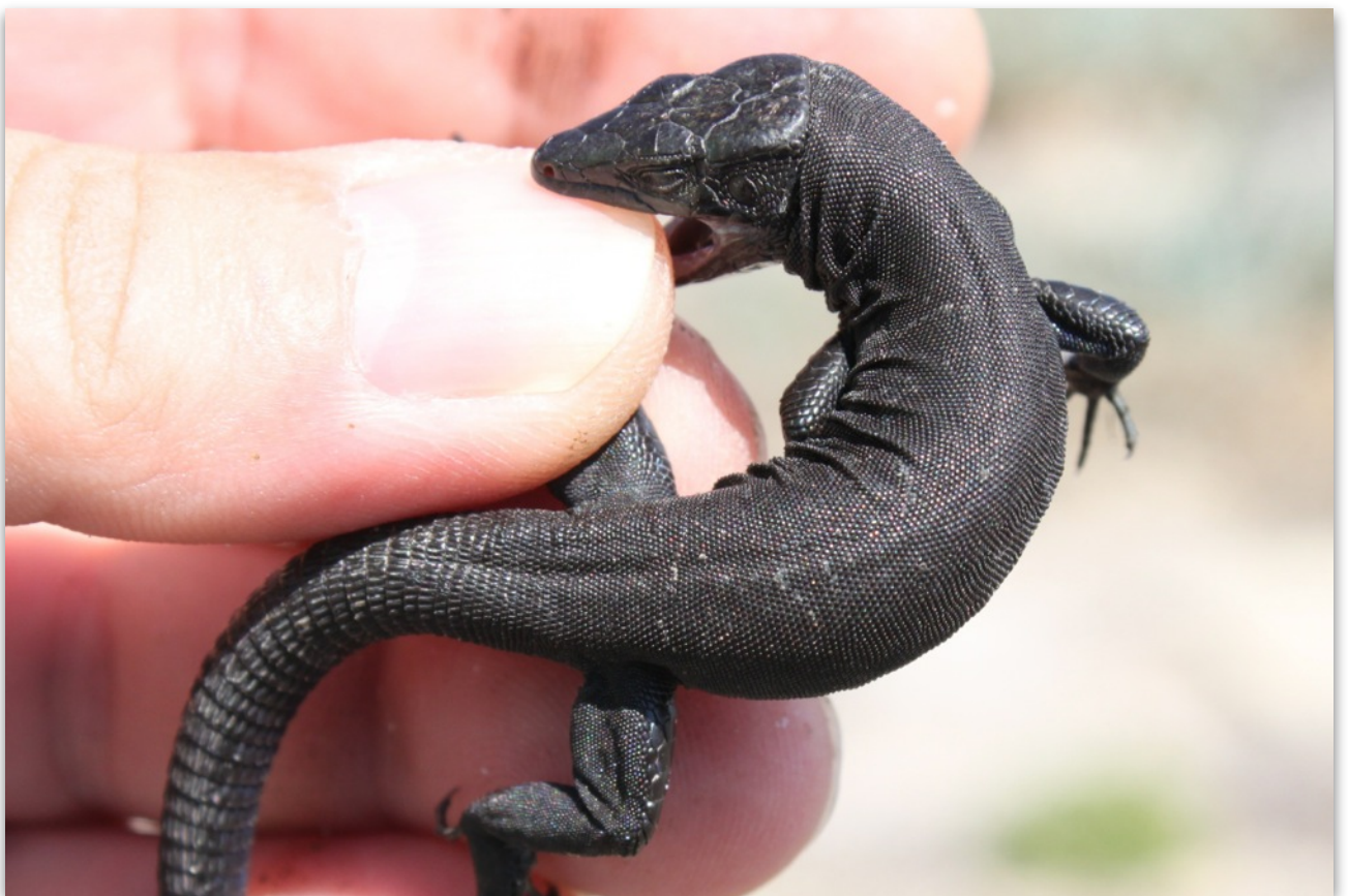
Image 27. Male Podarcis lilfordi at Na Guardis.