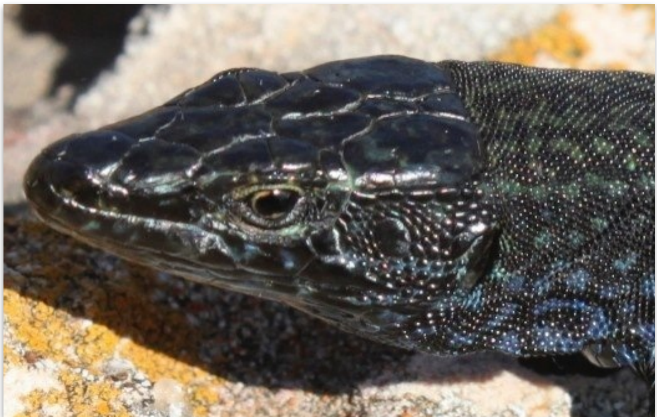
Image 6. Female Podarcis pityusensis at Bleda Na Bosc.