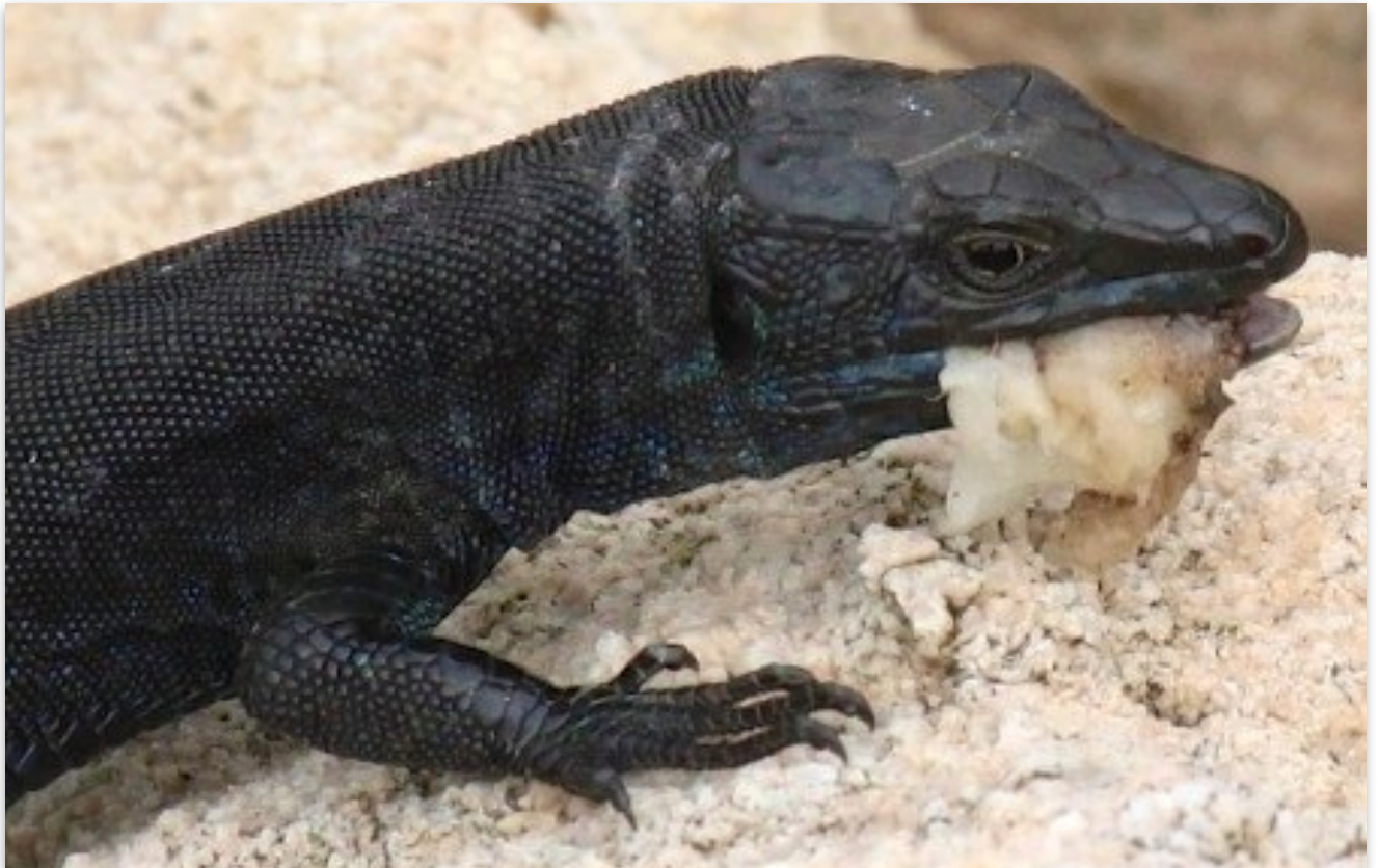
Image 7. Male Podarcis pityusensis at Bleda Plana eating gull spills.