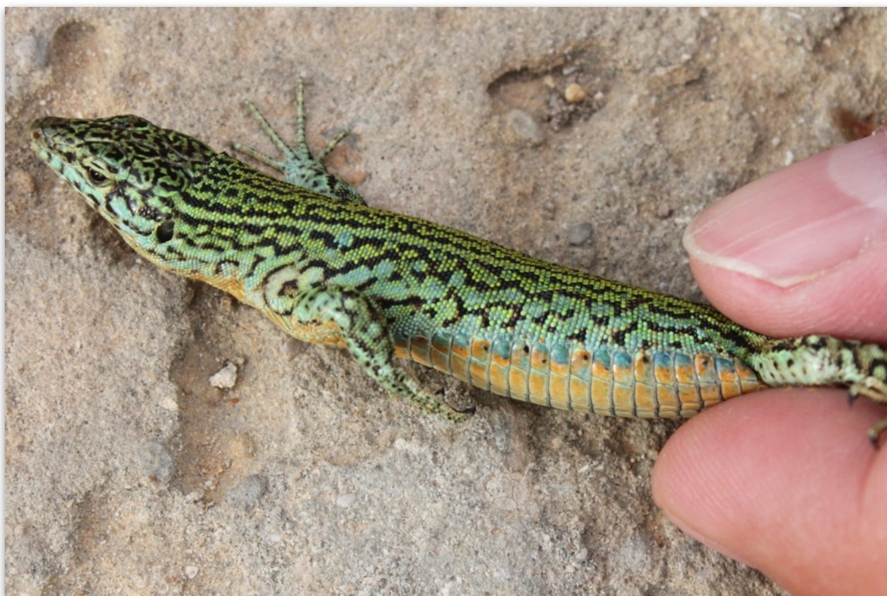
Image 18. Female Podarcis pityusensis at the formerly island „Illa Grossa”.