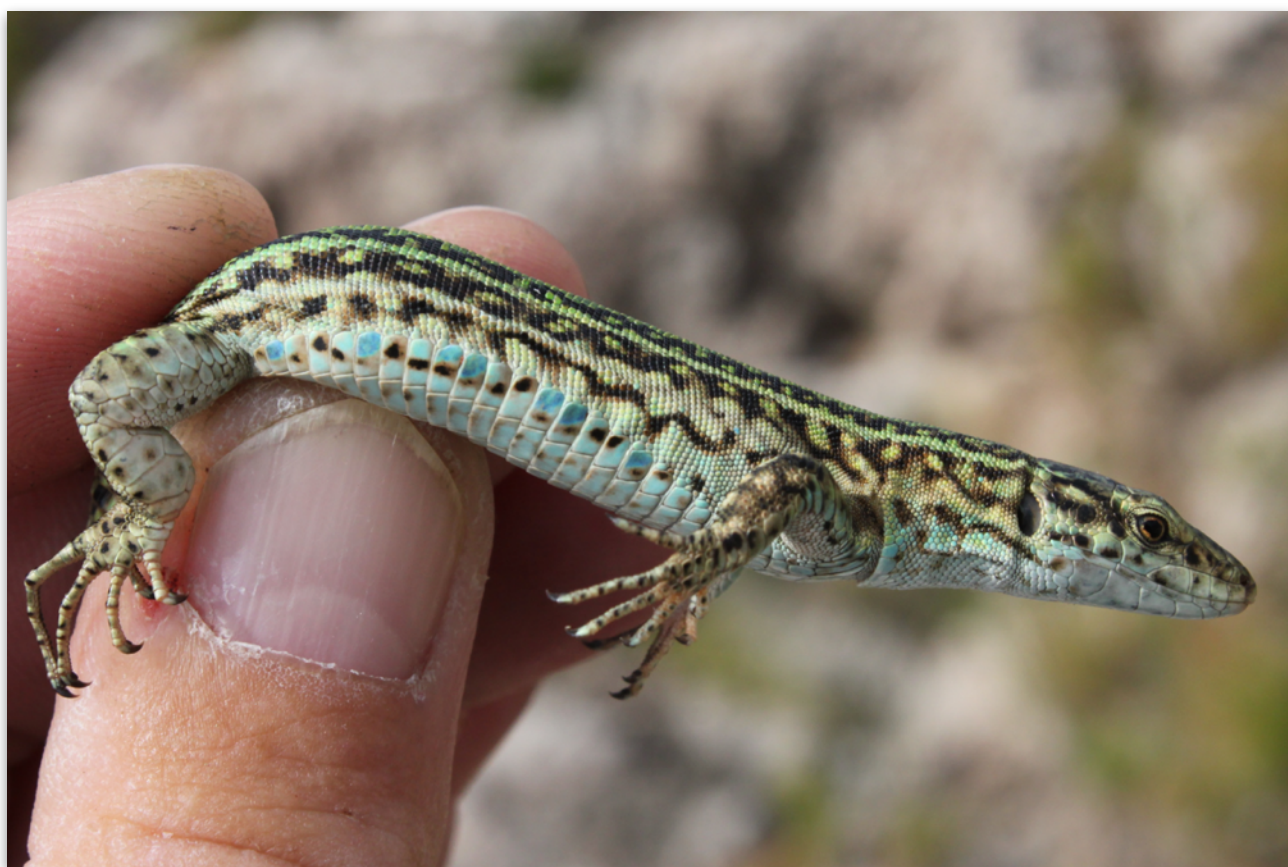
Image 10. Female Podarcis pityusensis at Malví Pla.