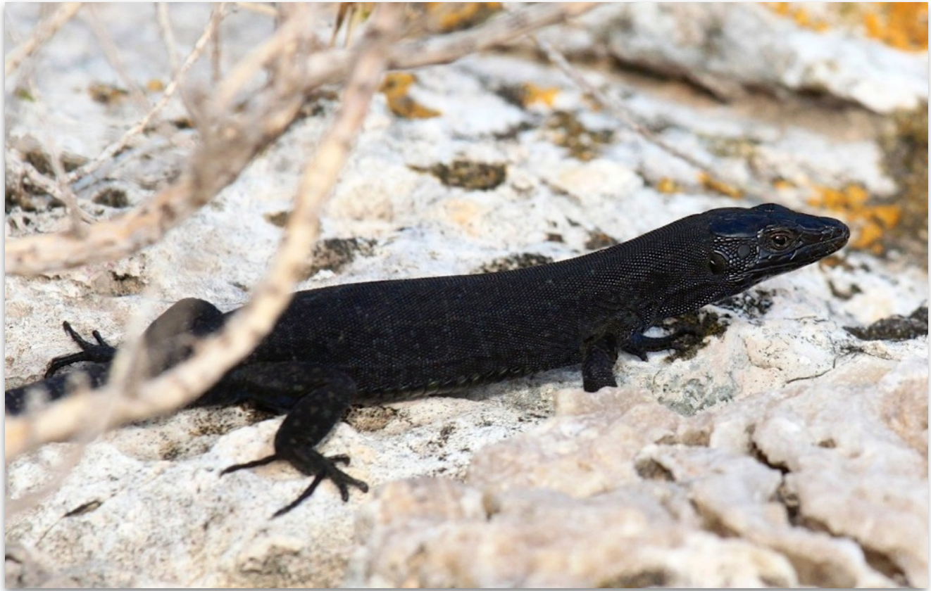
Image 5. Female Podarcis pityusensis at Bleda Na Bosc.