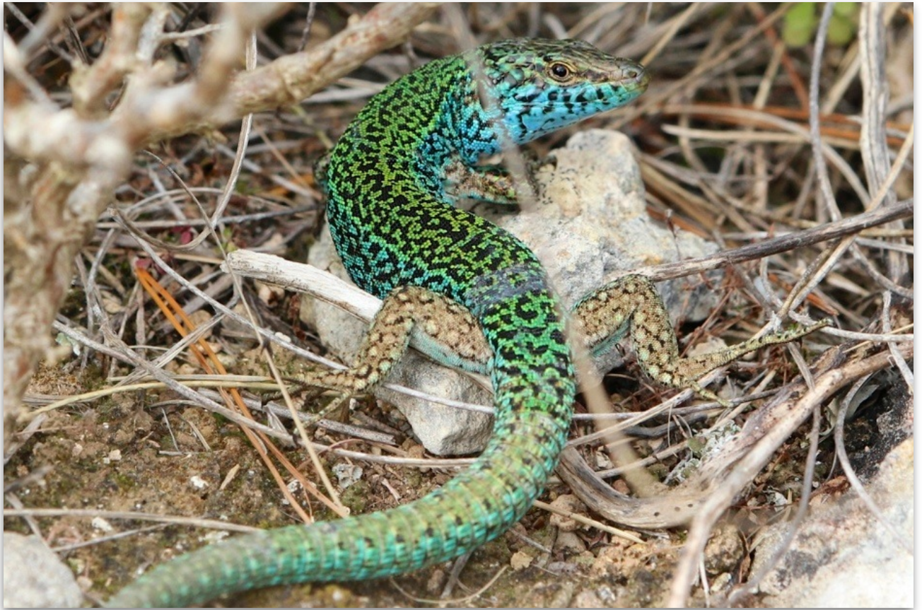
Image 15. Male Podarcis pityusensis at Espartar.