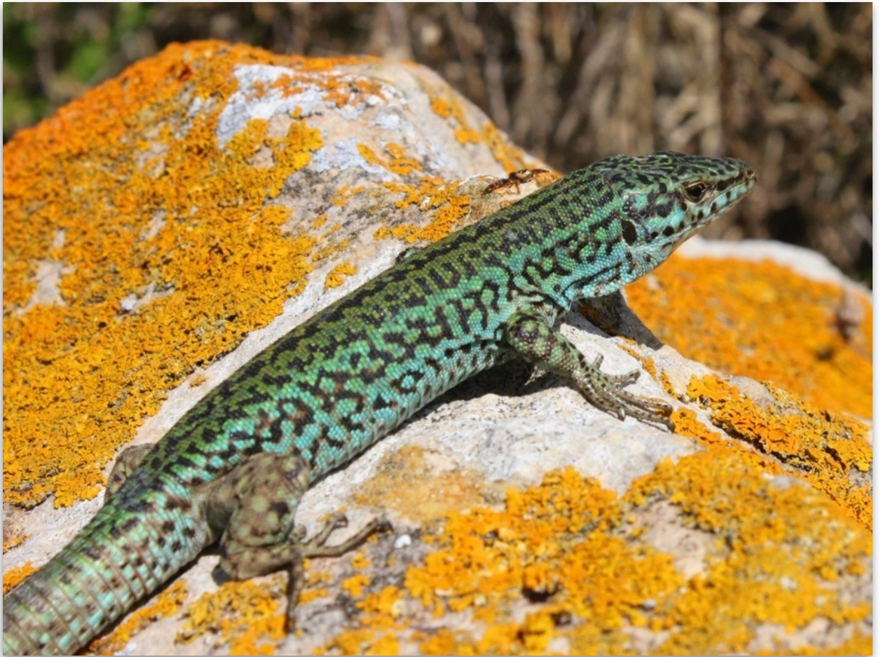
Image 3. Male Podarcis pityusensis at Es Canar.