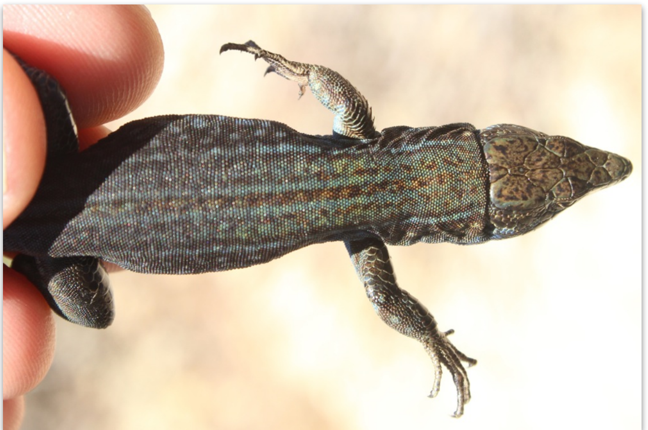
Image 23. Male Podarcis lilfordi at Cabrera Gran.