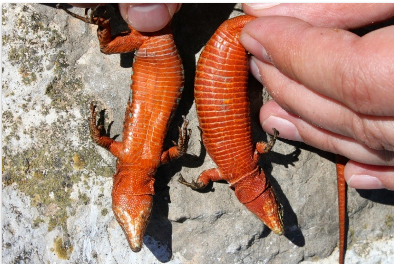
Image 12. Pair of Podarcis pityusensis at Illa Grossa de Santa Eulària.