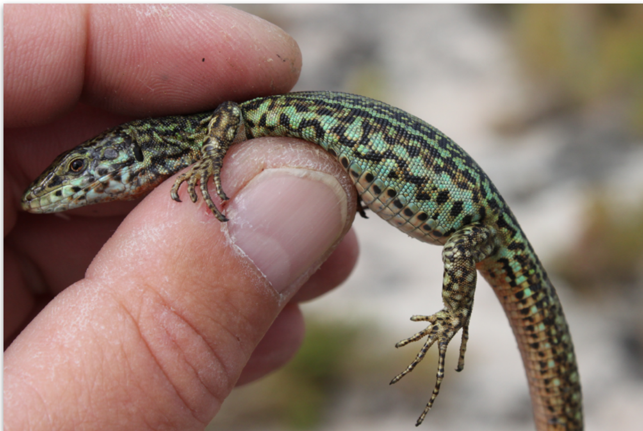
Image 9. Female Podarcis pityusensis at Malví Pla.