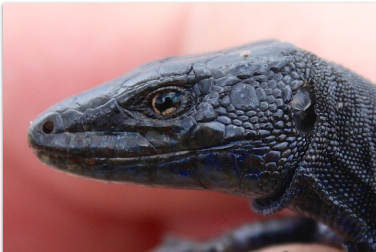
Image 24. Male Podarcis lilfordi at En Curt.