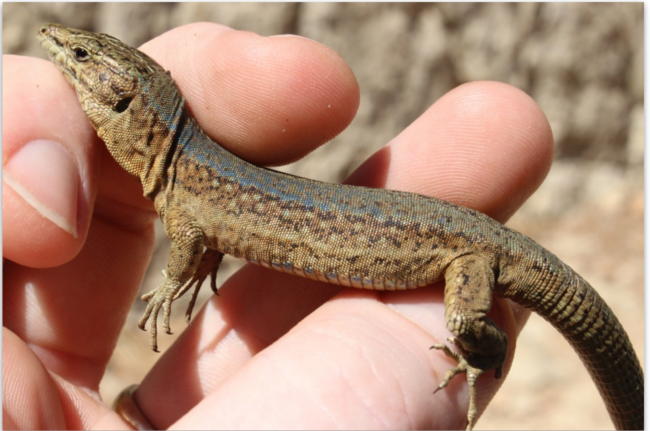
Image 22. Male Podarcis lilfordi at Sa Dragonera.