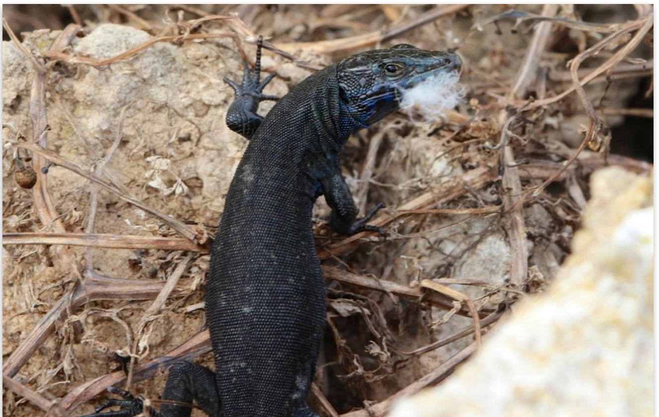
Image 8. Female Podarcis pityusensis at Bleda Na Gorra.