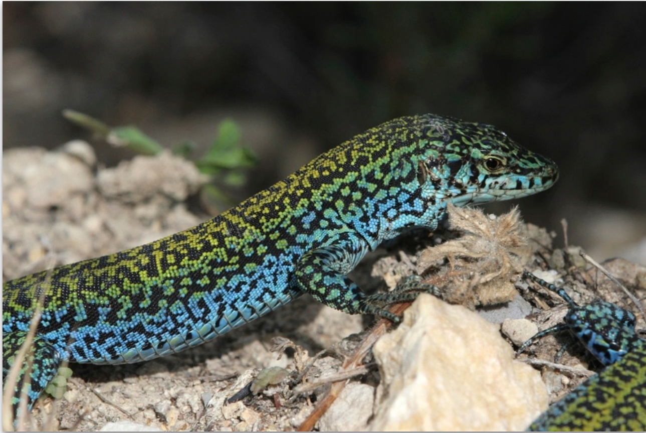
Image 13. Male Podarcis pityusensis at Es Vedrà.