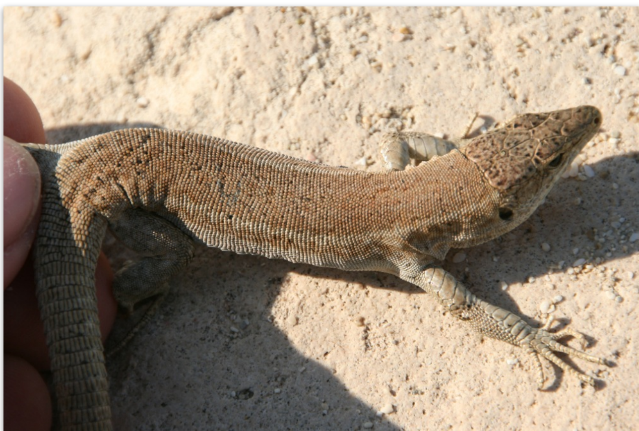
Image 21. Male Podarcis pityusensis at Punta Trucadors on Formentera.