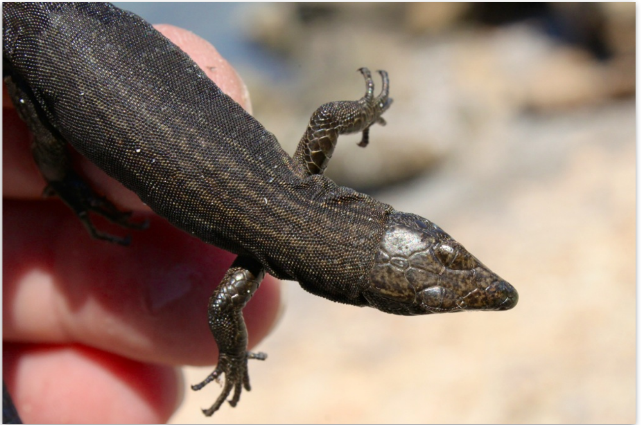
Image 26. Male Podarcis lilfordi at Na Moltona.