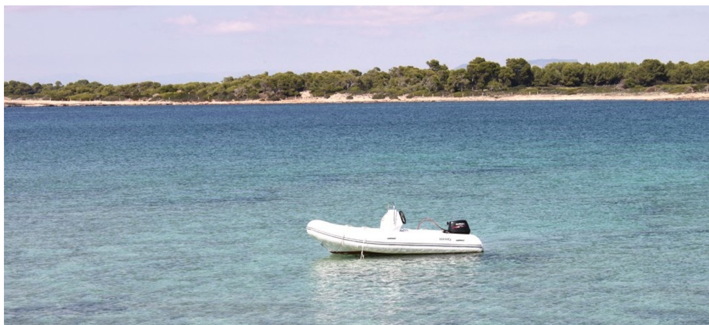
Table 2. Data collected on Mallorca and surrounding islands in 2013 (under permits CEP 21-23/2013), by K = MICHAEL KRONIGER and B = MARTEN VAN DEN BERG.