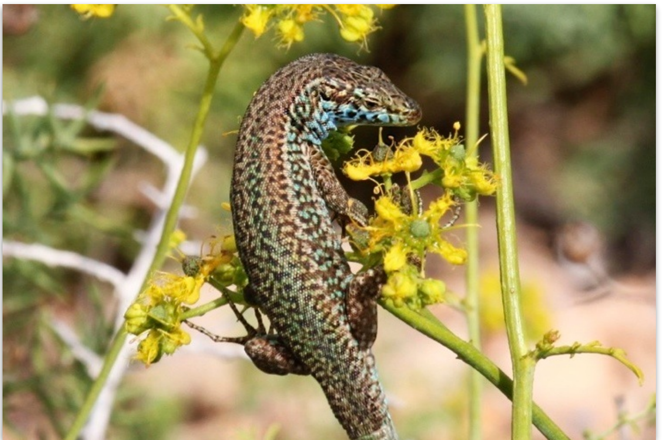
Image 16. Female Podarcis pityusensis at Espartar.