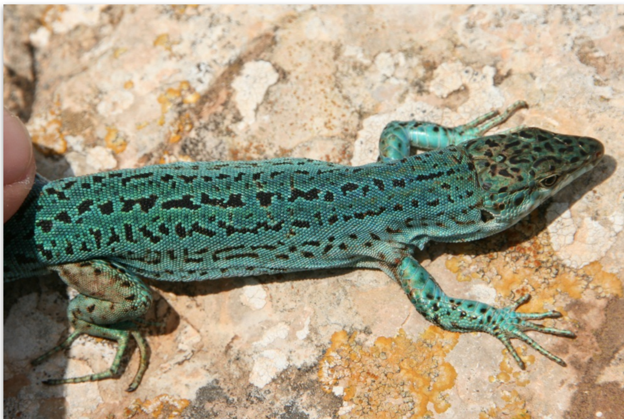
Image 20. Male Podarcis pityusensis at Cap de Barbaria on Formentera.