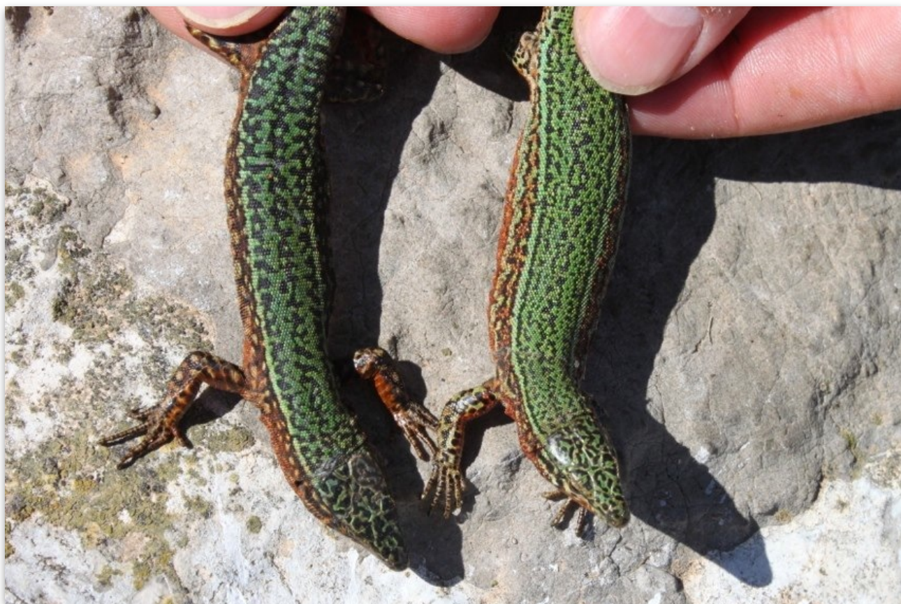
Image 11. Pair of Podarcis pityusensis at Illa Grossa de Santa Eulària.