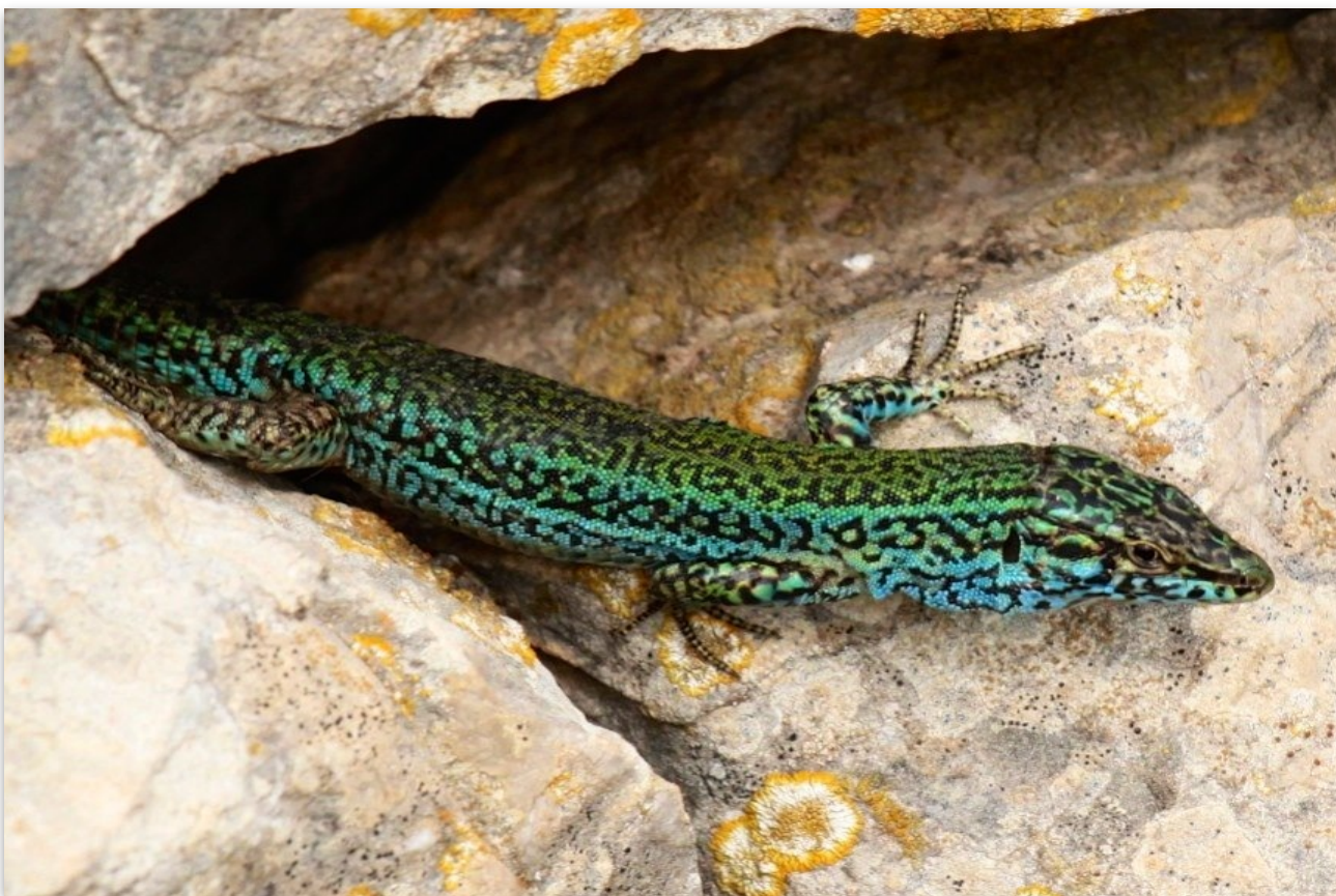
Image 14. Female Podarcis pityusensis at Conillera.