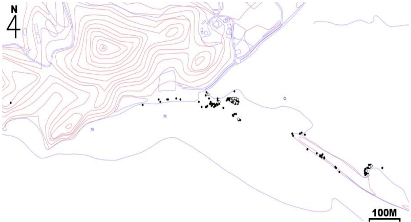
Fig. 2. Capture (closed circle) and recapture (opened circle) points of E. argus at Baramarae Beach.

Table 2 shows the physical parameter of E. argus . The SVL, TL and BW of males and females were not significant ( P_s > 0.05 ) as Kim et al. (2010). But our results showed the rate of recaptured females tends to be greater than that of males. We think that the movement of females is slower for pregnancy than males, so females might be easier to capture than males.