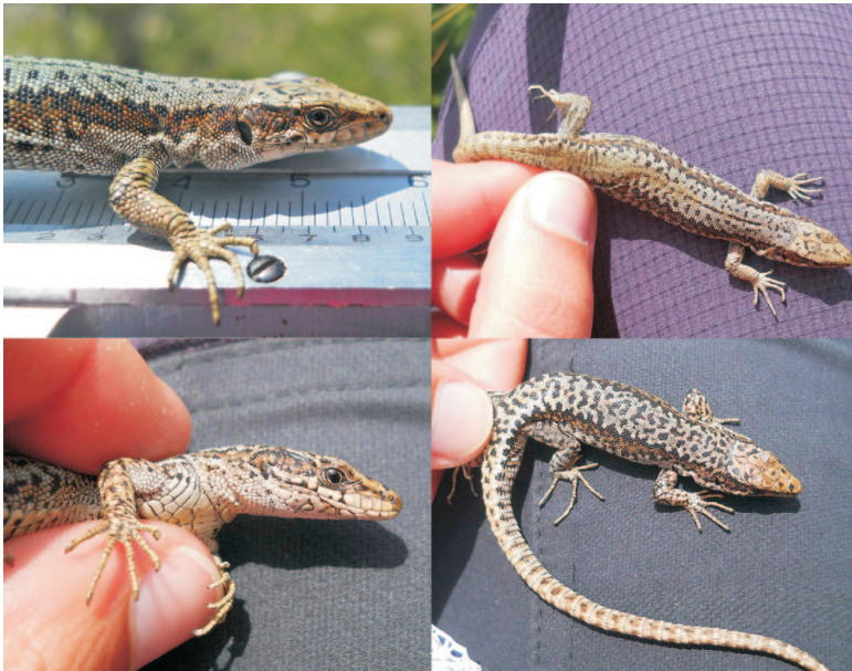
Fig. 2. Photographs of right and dorsal sides of a female (above) and male (below) Horvath's rock lizard ( Iberolacerta horvathi ) found on Dinara Mountain (Croatia).