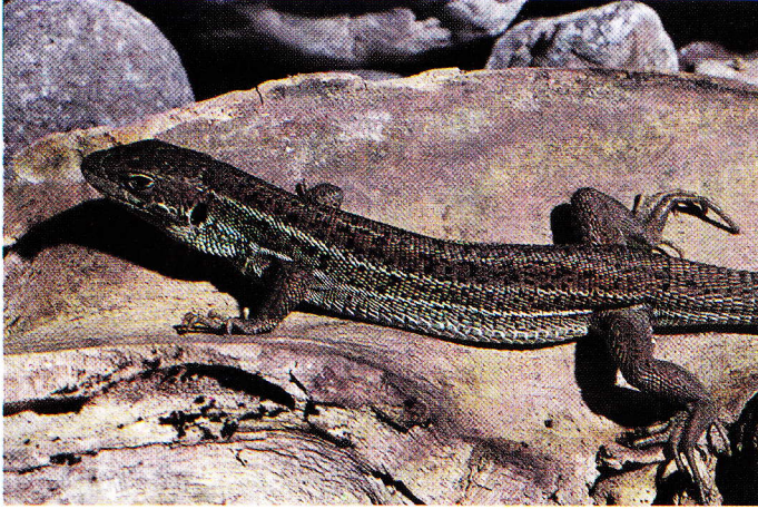
66G. Lacerta trilineata galatiensis