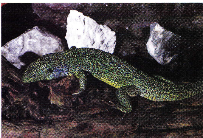
66D. Lacerta trilineata cariensis