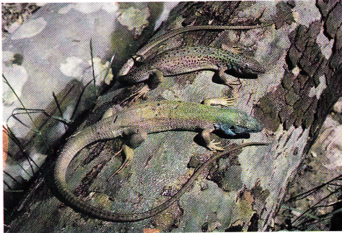
66B. Lacerta trilineata pamphylica