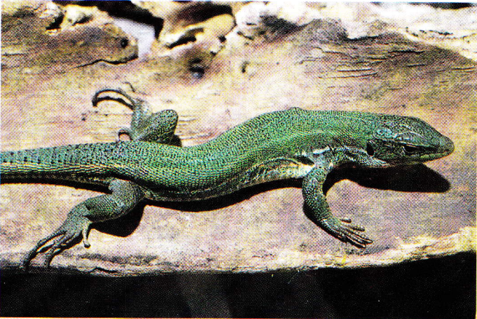
66H. Lacerta trilineata ciliciensis