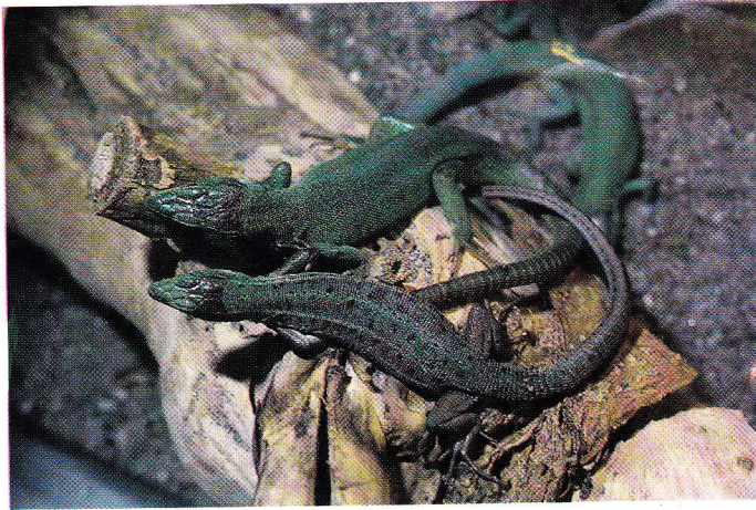
66A. Lacerta trilineata media