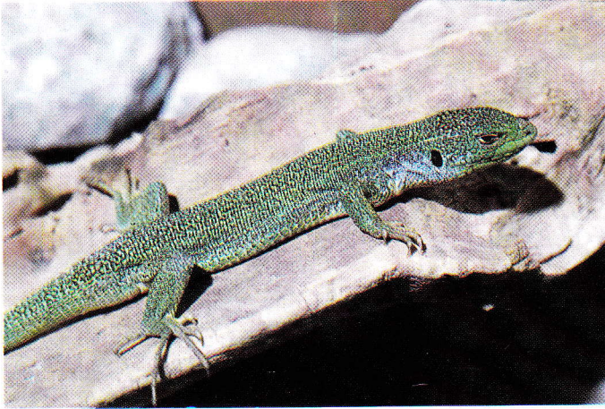
66E. Lacerta trilineata isaurica