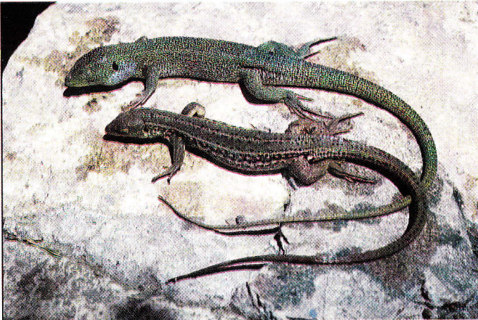
66F. Lacerta trilineata wolterstorffi