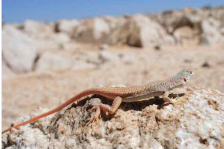
Figure 3: Pedioplanis husabensis in typical marble boulder dominated habitat in the Husab area.

According to the Namibian Nature Conservation Ordinance of 1975, the conservation and legal status for P. husabensis is viewed as “endemic” and “secure” and proposed as “protected” under the new Parks and Wildlife Management Act (In Prep.) (Griffin 2003). Pedioplanis husabensis is furthermore viewed as “threatened” by the ‘Uranium Rush’ (SAIEA 2010). Its total known range at this stage is probably less than 5,000 km 2 (Wassenaar et al. 2010), which would put it in the “endangered” category according to the IUCN Red List Categories and Criteria (IUCN 2001).