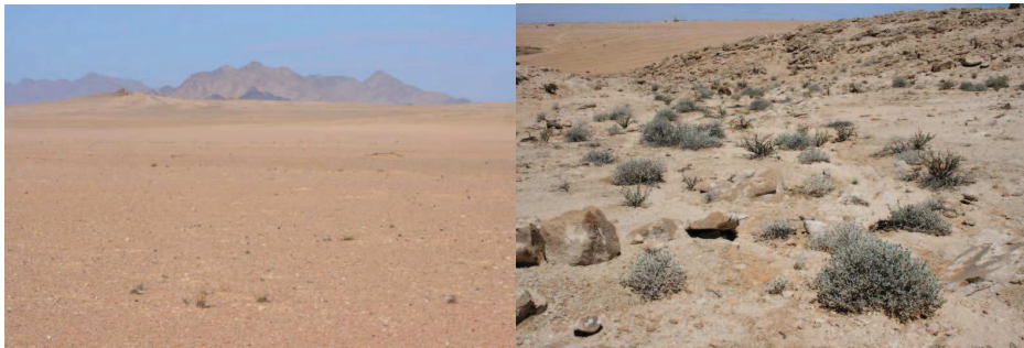
Figure 2: Left) Sparsely vegetated grassy gravel plains typical of most of the Swakop Uranium area with the Husab Mountain in the background. Right) Vegetated marble ridges extending down towards the Khan River and occurring as an intrusion into widespread exposed broken rocky granite and metasediment terrain. Note the drilling rigs on the horizon in the background.

The habitats covering the largest part of the study area were described as part of an Environmental Impact Assessment for the mine (Wassenaar & Mannheimer 2010). Typical habitats are the Khan River, three plains habitats (gypsite plain, grassy gravel plain [Fig. 2-left] and hard undulating plain), rocky valley drainages, plains drainage channels, broken rocky pink granite, broken rocky black metamorphosed sediments, marble intrusions in broken rocky terrain (Fig. 2-right), and koppies and ridges on plains. The latter included ridges consisting of mostly marble rock with relatively high habitat diversity, as well as more simple metamorphosed sediments of the Khan group. It is especially the marble ridges that are relevant to this study, both those occurring as inselbergs on the plain, and those that occur as intrusions into broken granite and meta-sediment rocky terrain (Fig. 2-right).