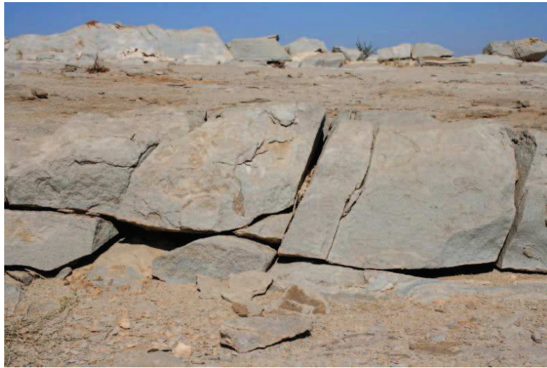
Figure 4: Typical broken grey marble ridge with medium/large boulders with numerous cracks and crevasses used as refuge by P. husabensis in the Husab area.

more open areas with smaller boulders or plate rock while R. boultoni were mainly encountered in areas with large boulders. P. husabensis seemed to favour the intermediate areas which are vegetated with a combination of medium and large boulders with suitable refuge (Fig. 4).