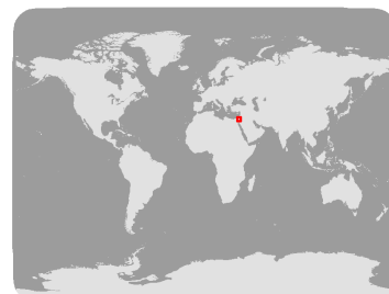
The boundaries and names shown and the designations used on this map do not imply any official endorsement, acceptance or opinion by IUCN.

Compiled by: IUCN (International Union for Conservation of Nature)