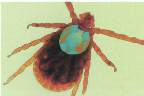
Fig. 1: Nymph of Haemaphysalis concinna from a lizard. The picture combines a photo taken in visual light, an auto-fluorescence photo (scutum), and a line drawing. Note the shape of the palps, of the scutum, and the festoons. Tick length: 1.4 mm.

(MALKMUS 1995). Nothing is known about the pathogenic potential of Haemaphysalis spp. to reptiles; yet the presence of unfed ticks only may be interpreted as a hint for the existence of a poor adaptation of this tick species to the reptilian hosts. Nevertheless, except for the unusual host spectrum, all other ecological parameters of our tick finding, like activity season, species distribution area, and microclimate, were within the typical range (NOSEK et al. 1967). The area of tick infestation on the lizards' bodies was restricted to the trunk close to the insertion of the anterior limbs. This may be due to the ability of lizards to detach ticks by feeding and by scratching with the limbs.