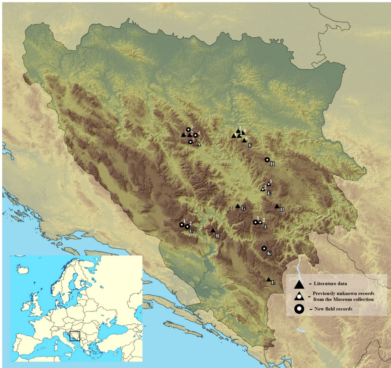
Figure 5. Zootoca vivipara distribution in B&H (numbers and letters on the map correspond to the numbers and letters in Table 1)